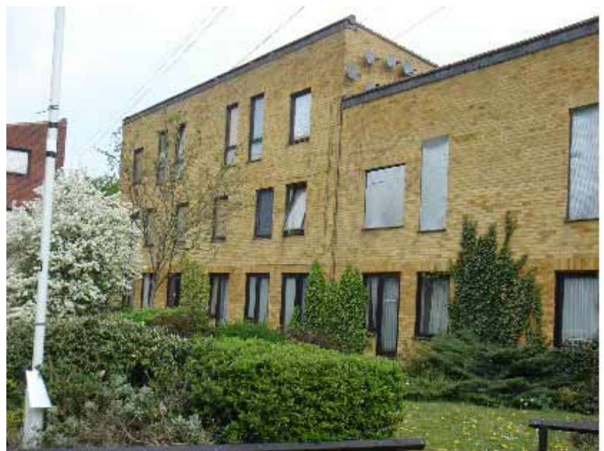
Figure 14: Clays Lane community housing. Demolition of this site commenced in April 2007.

The plan is to re-model the Olympic Village after 2012 into affordable housing for 3000 people. However, it does show that houses have had to be lost in the process. London's plan to create a pool of social housing reflects similar plans in Sydney. However, the costs of regeneration and a massive environmental clean-up in Sydney were so great that the Olympic Village was sold off for housing at full market rates. It would be fair to ask whether similar financial pressures will occur in London.