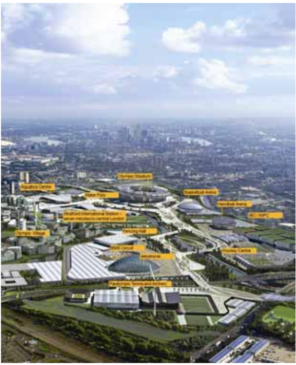
Figure 3: Computer-generated image of London's Olympic Park.

The costs of hosting the Olympics are considerable, and have huge impacts upon people, space and financial commitment. London's bid – unlike that of Paris – was focused upon a complete re-brand and re-construction of a brownfield site along the Lea Valley in east London. A range of new facilities is to be built in the area, together with the use of existing stadia for football. The central hub will be Olympic Park (Figure 3), parallel to the Lea River, and containing several Olympic venues, each located within walking distance of each other. Like Sydney's 2000 Olympics, most facilities are centralised, with only very limited access to road traffic, in order to reduce the traffic congestion which had brought Barcelona and Atlanta to a halt during their respective Olympics. Such centralisation is a recent concept; although tried with great success by Sydney, it was not used in Athens, and only to some degree in Beijing.