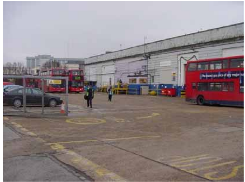
Figure 4: The current Hackney Stadium prior to July 2007, and until recently used by Stagecoach as a bus depot. One of the issues facing the ODA and LDA is how to provide the servicing facilities that are essential to any city, as well as the other benefits which, it is hoped, the Olympics will bring. At one point this bus depot could have faced a move to as far away as Ilford.

Central to the park are the walkways and running tracks, with broad thoroughfares to the main transport links at Stratford. Like Sydney, there will be no private car parking. Although no plans have as yet been released, public access is likely to be by public transport, with large parking venues at connecting stations well away from the city. One of the IOC's main criticisms of London's bid at an early stage was the lack of extra capacity of London's road system, together with reservations – since much improved – about the capacity of the public transport system. In Sydney, public bus and rail access was included in ticket costs for those who lived up to 100km from the Olympics.