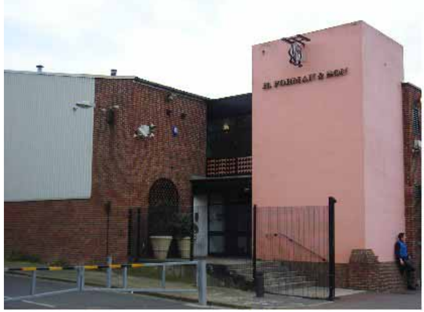
Figure 7a: H Forman warehouse on Marshgate Lane, the heart of the Olympic Park in February 2007 - prior to clearance.

Even now, east London is London's manufacturing heart. That said, the area has undergone deep-rooted change since the 1971 census, in which about 30% of the working population worked in manufacturing, the UK's greatest concentration. A combination of factors – such as the rise of container shipping, increasing size of ships, and unionisation of London's docks – led to the emergence of deeper container ports away from the shallow stretches of the Thames estuary in locations such as Felixstowe and Dover. The Port of London closed in 1981, with the loss of over 10 000 jobs in the port and several times more in related servicing. The regional shift in food processing companies to docks elsewhere – only Tate and Lyle remain in the former docklands area now – together with the global shift in manufacturing means that only 7.5% worked in manufacturing in 2001.