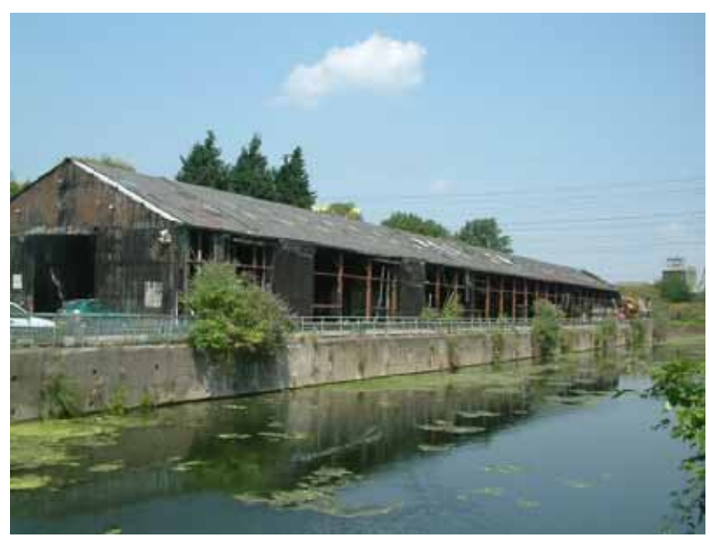
Figure 13: Derelict land in the Lea valley, summer 2005.

The Lea Valley Project will revitalise the area to extend the Olympic Park northeastwards from the lower Lea Valley along the waterways out towards the edge of London. A separately funded project is already taking place to clean up the water of the Lea River and its separate canals. In the change, some channels will be cleared, cleaned, and altered, and wildlife species such as newts are being moved away