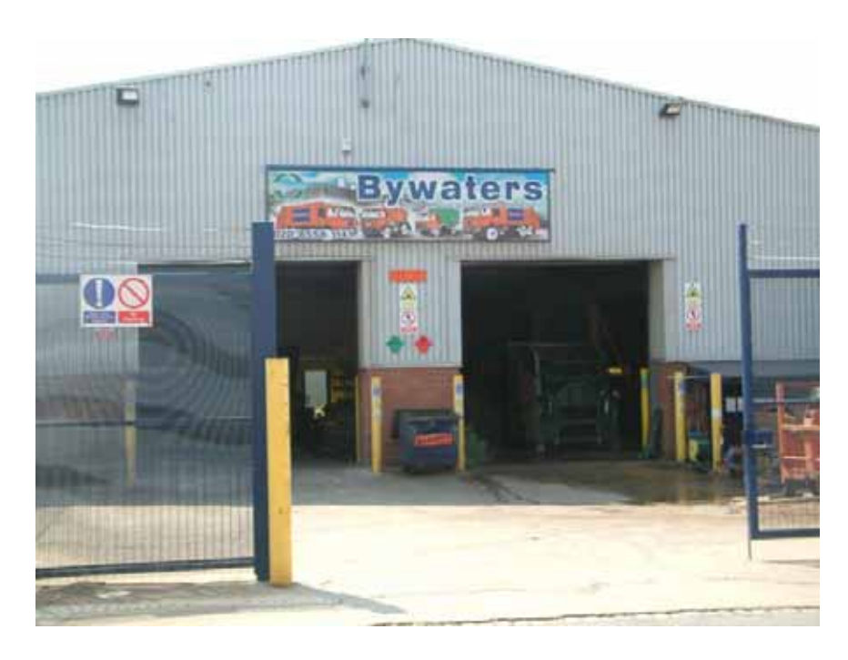
Figure 7b: Bywater's recycling plant, off Marshgate Lane in July 2005 – prior to clearance.

The collapse of the traditional economy has now been overshadowed by the massive regeneration and growth of finance and banking in the Canary Wharf area of London's Docklands. This remains the world's biggest single urban regeneration project in the past 25 years. However, whilst there has been huge growth in service sector employment (particularly in banking, insurance and financial services), there are pockets of economic deprivation in east London. In 2001, Newham and Tower Hamlets were the UK's two most deprived boroughs in spite of their location adjacent to one of the western world's most dynamic and prosperous engines of the economy.