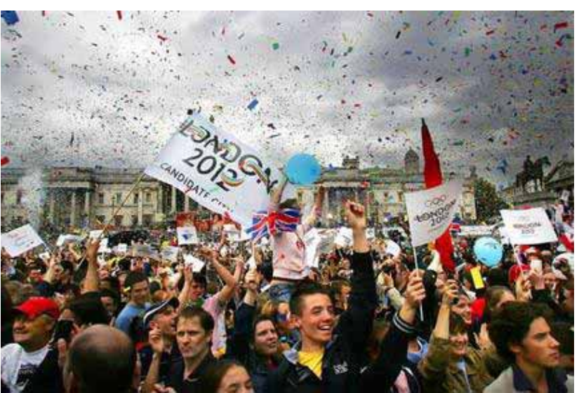
Figure 1: Scenes in Trafalgar Square as London wins the 2012 Olympics.

On 6<sup>th</sup> July 2005, the International Olympic Committee (IOC) announced that London would host the 2012 Olympics. Whether it is the prestige of hosting a global event, love of sport and competition, enthusiasm for a major spectacle, or a combination of these, there is no doubt that London's celebrations in winning the bid for the 2012 Olympics gave the people in Trafalgar Square great cause for celebration. Whilst many people remember the London bombings 24 hours later, most will probably also remember these jubilant scenes (Figure 1) similar to those witnessed in Sydney 12 years previously in September 1993, where over 1 million people crowded into the centre of the city to learn that the city would host the 2000 Olympics.