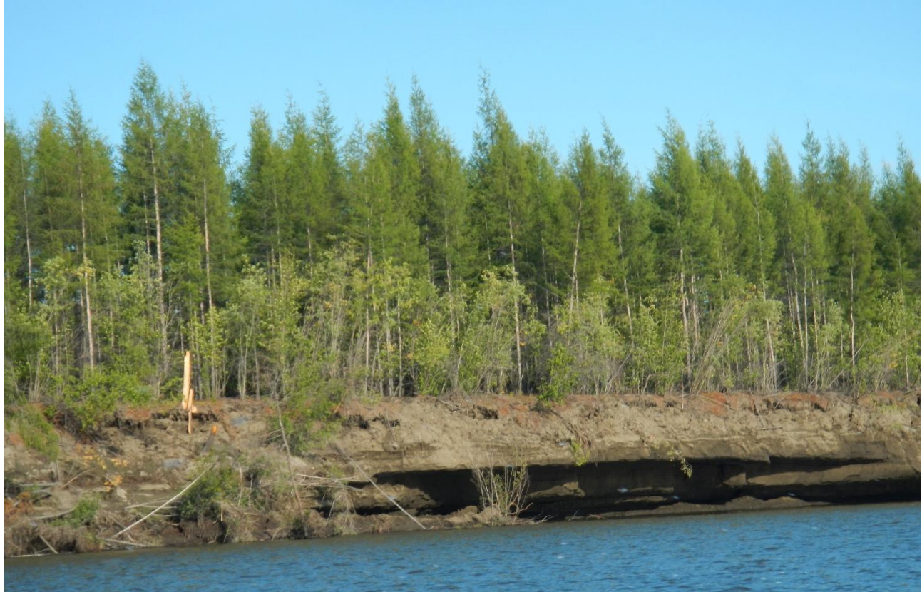
Figure 2 Russian Taiga