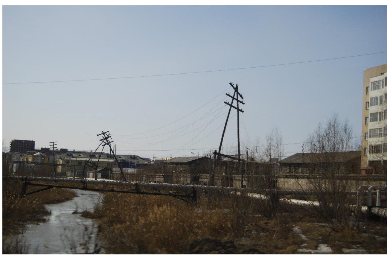
Figure 5 © Thomas Opel