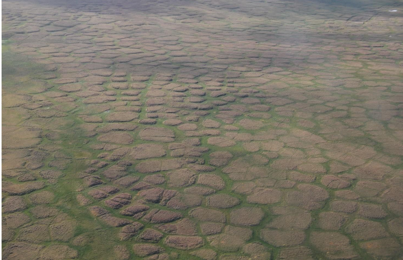
Figure 3 Russian tundra