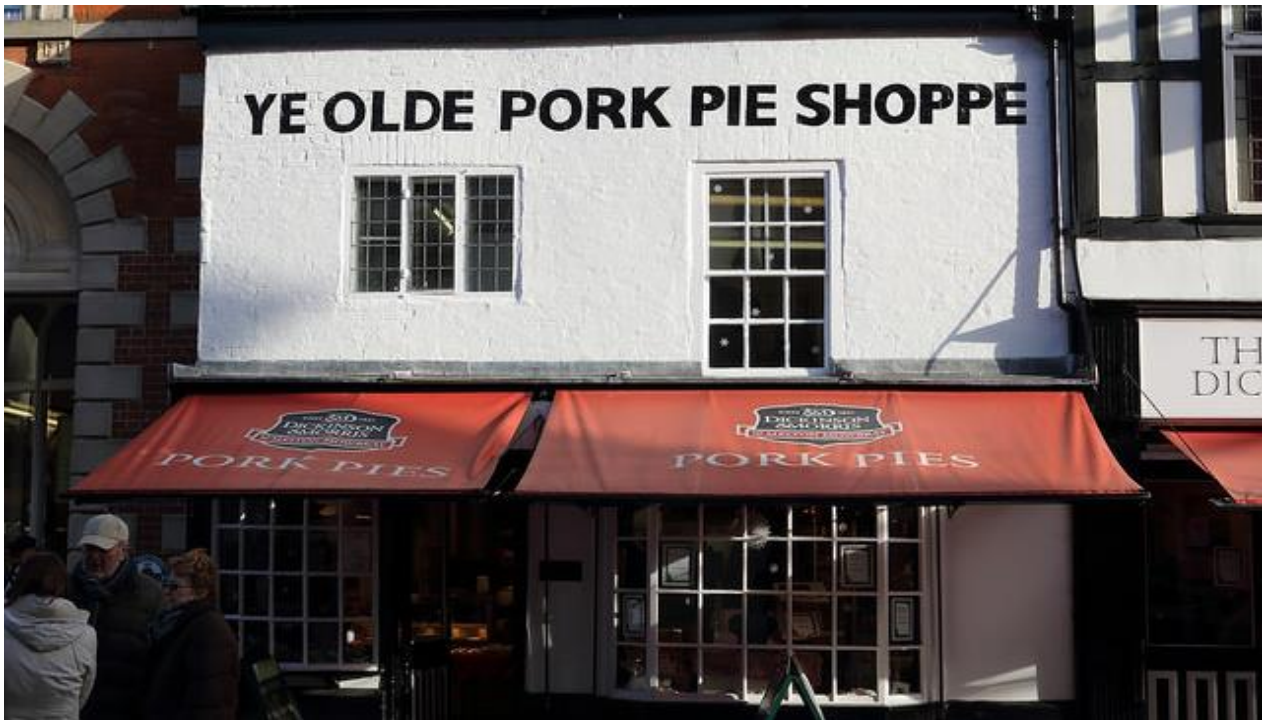
Melton Mowbray pork pies