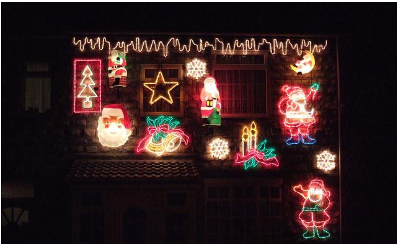
Christmas Lights, Yorkshire

As human geographer Tim Cresswell (2008) has suggested, “places, then, are particular constellations of material things that occupy a particular segment of space and have sets of meanings attached to them”. The Heritage Index shows us how place is shaped and produced by both material and representational geographies. So, material things (buildings, castles, pork pies) are more than just the passive recipients of cultural values and meanings but rather they also actively shape the “imaginative geographies” of place and place-making. The Index shows how external agencies attempt to quantify these experiences for future development and place-making activities. The Heritage Index is one such practice, but it also reflects the success of heritage and place-making agencies such as National Trust, English Heritage, and the European Commission, which establish and develop local places through national policies.