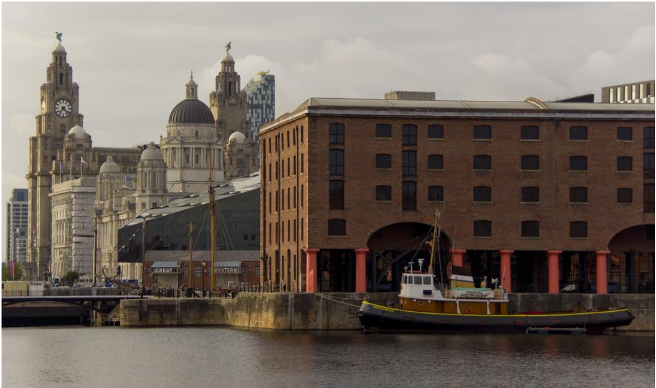
Liverpool Albert Docks

In 2015, it was reported widely in the press that the North West town of Warrington, Cheshire was ranked lowest in the index and therefore the “worst town for culture in Britain” (The Guardian, September 2015). This left the people of Warrington understandably upset, and the community has worked hard to have its assets recognised, such as: it’s home to England’s first industrial canal, during WW2 the largest US Army Air Force airfield outside of the US, and in 1987, it became home to the first IKEA store ( Heritage Lottery Fund, 2016 ).