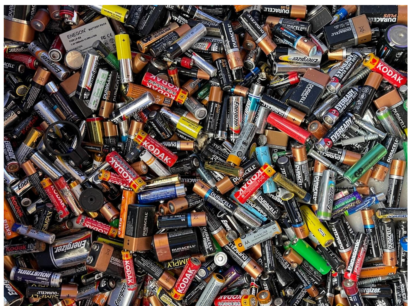
Figure 1 batteries have enhanced product mobility but also pose a recycling challenge © John Cameron

A dry cell battery is the most common type of battery used today. It converts stored chemical energy into electrical energy. Internally there are 3 sections to a battery: an anode (-) , cathode (+) , and the electrolyte, consisting of zinc, graphite, and ammonium chloride paste. A chemical reaction within the battery causes a build-up of electrons in the negative terminal anode, creating an electrical imbalance between the anode and the positive terminal cathode. The electrolyte prevents the extra electrons rearranging directly into cathode. When a 'conductive path' is created, the flow of electrons travels to the cathode — providing power to any appliance along the way in the closed circuit.