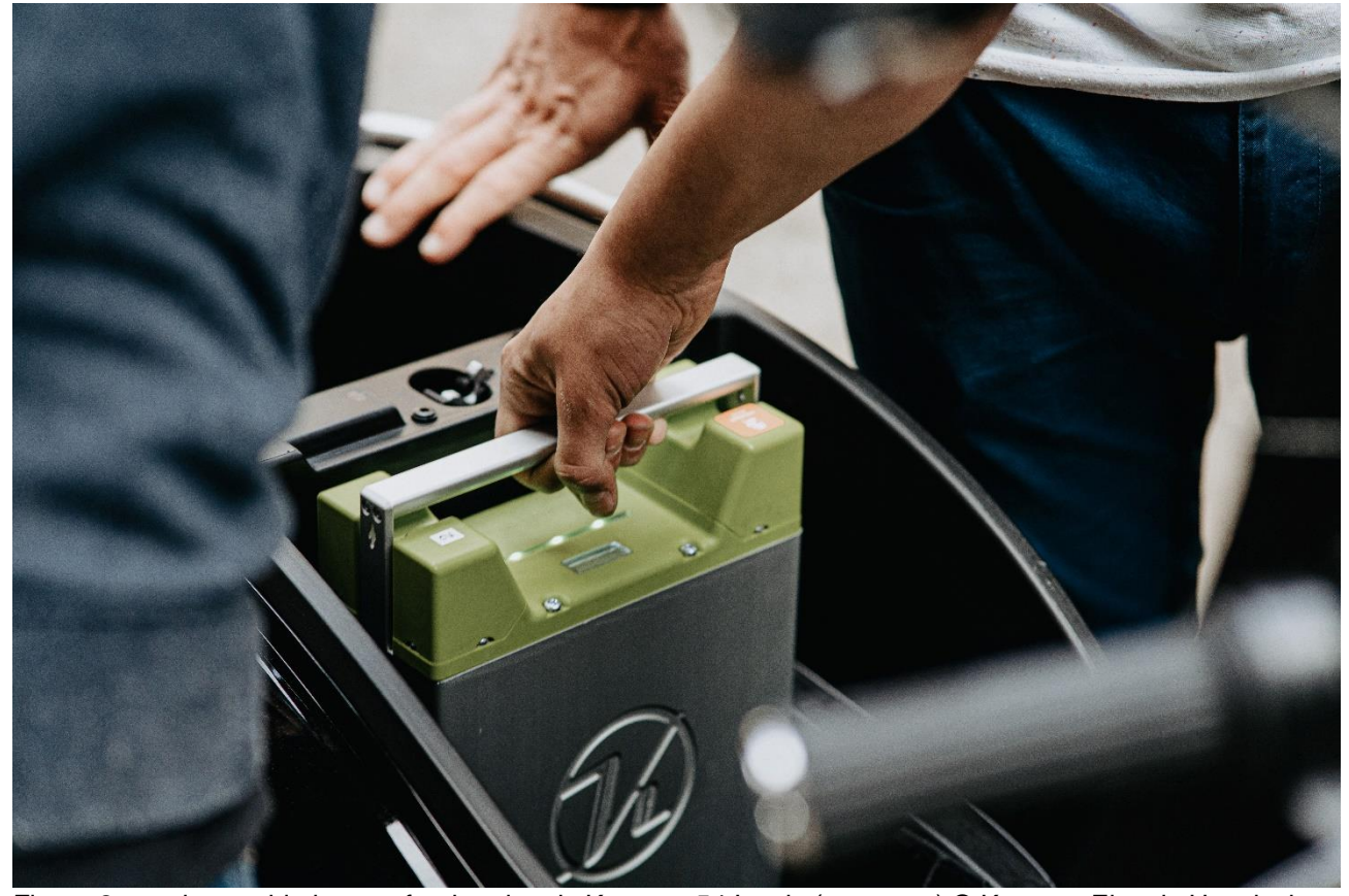
Figure 2 a rechargeable battery for the electric Kumpan 54 Iconic (a scooter)