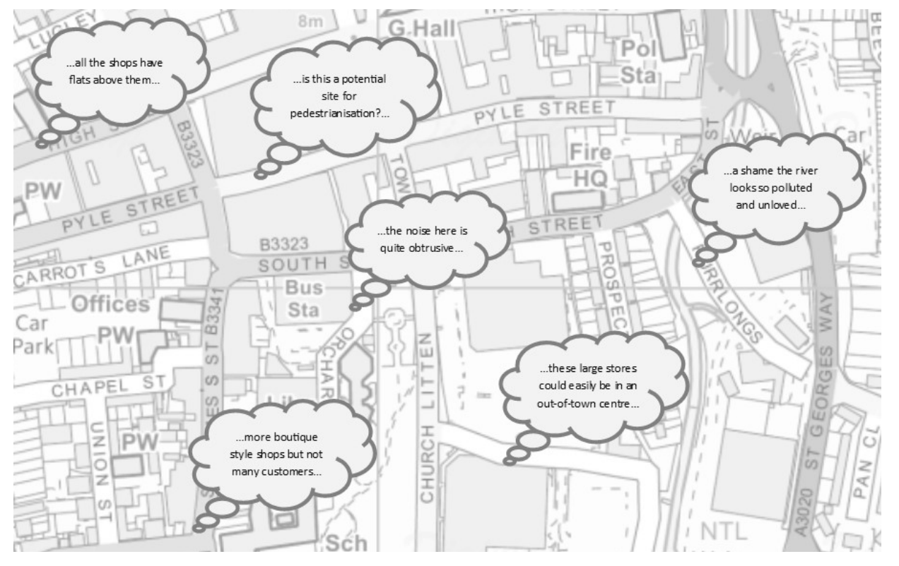
A map of some of the researcher's observations of a town.

Equally, personal observations can be mind-mapped, overlaying a true map or an interpretive representation of the space in question.