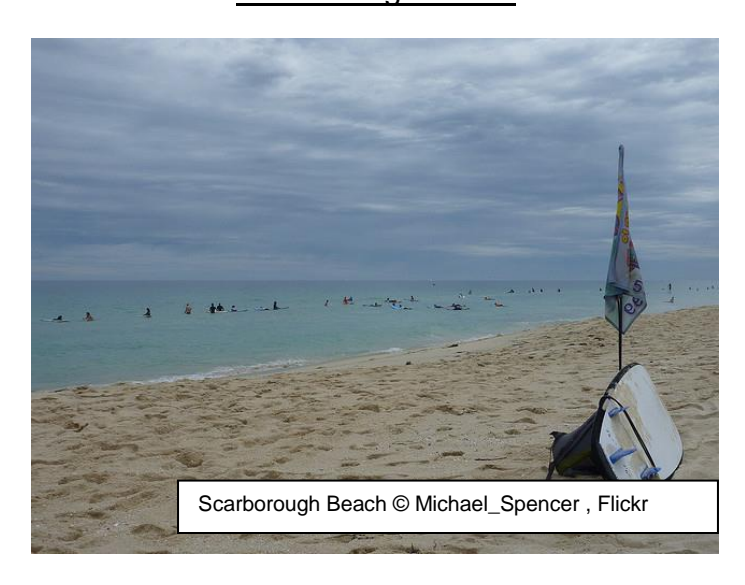
The location of Perth