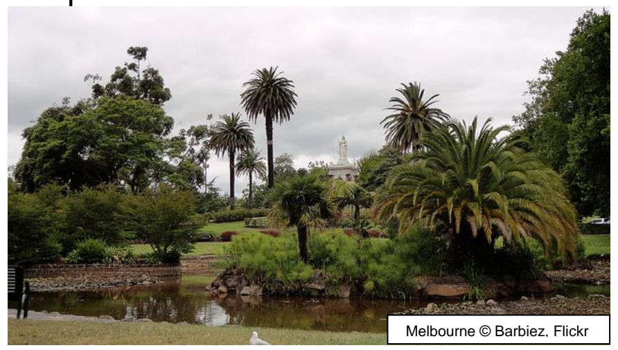
The location of Melbourne