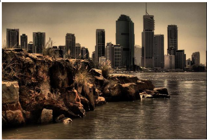
Brisbane CBD Sepia Tone HDRI