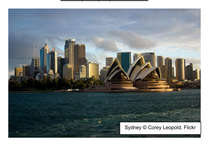
The location of Sydney