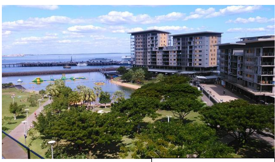
Darwin at Winter

Darwin has winter-free tropical climate with an average temperate of 30°C. From May to September the days are mild, with gentle winds and blue skies. December to March is the best time to visit this part of the country, as it is greenest and you can see the secluded waterholes, cool waterfalls and billabongs full with exotic wildlife. The coolest months of the year are June and July, when the daily temperature ranges from 19°C to 30°C.