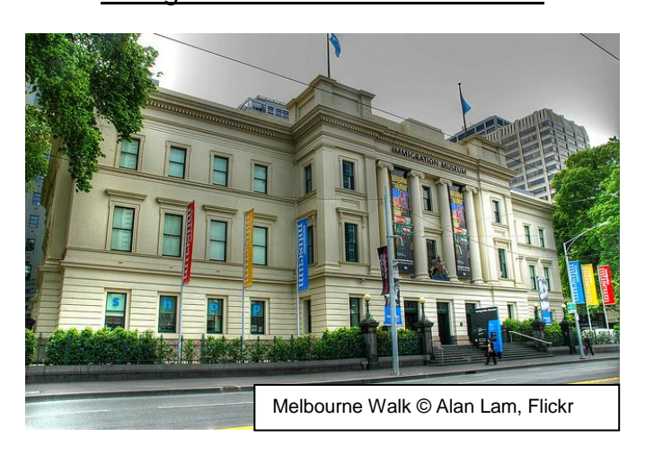
The city park