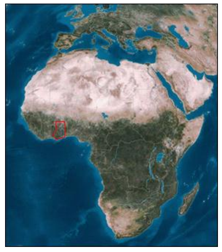
Satellite image: NASA public domain image