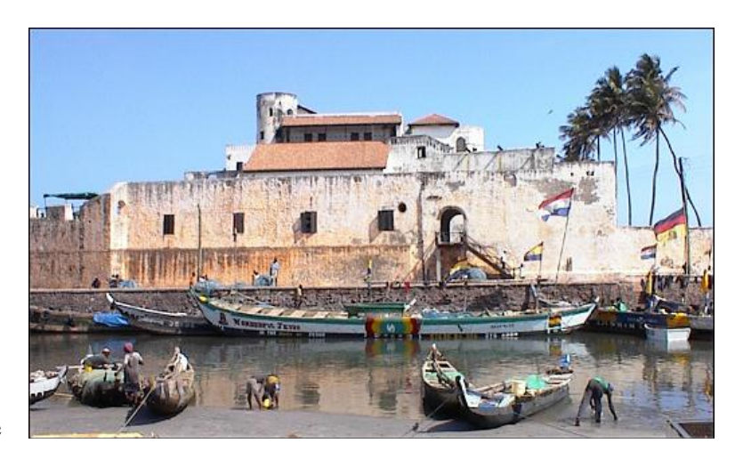
Elmina Castle - a fort built by the Dutch in 1481

By 1901, all of the Gold Coast was a British colony, with its kingdoms and tribes forming a single unit. Various natural resources, such as gold, metal ores, diamonds, ivory, pepper, timber, corn and cocoa were shipped from the Gold Coast to Britain. The British colonisers built railways and a complicated transport infrastructure which formed the basis for the transport infrastructure in modern-day Ghana. Western hospitals and schools were also built, an attempt by the British to provide what were then modern day amenities to