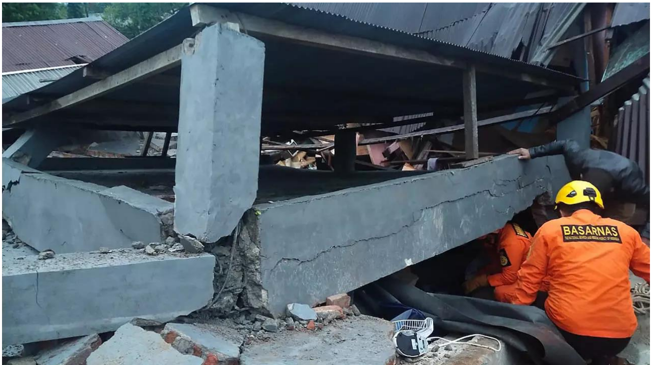
A handout photo released by BASARNAS of the Sulawesi earthquake

Excavators, cranes, rescue teams and rescue dogs have all been deployed.