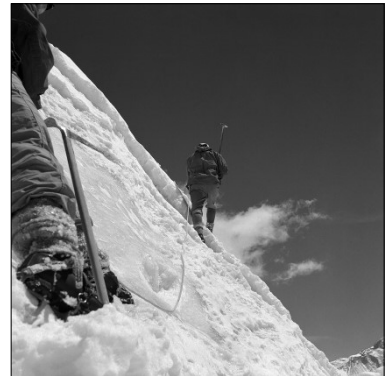
Forging a path in the ice.