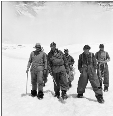
Team members return to Camp IV after the ascent.