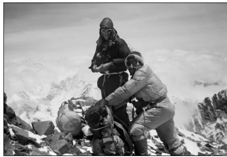
Edmund Hillary and Tenzing Norgay on the South-East ridge.