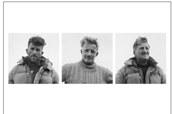
Edmund Hillary, Charles Evans and John Hunt (left to right).