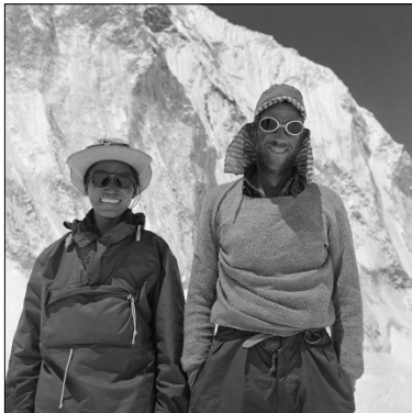
Tenzing and Hillary after returning from the summit.