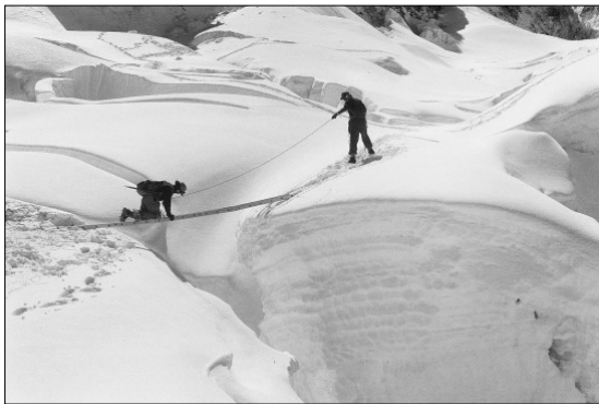
Edmund Hillary assists Tenzing Norgay over a crevasse.