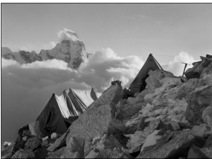
Rocky, exposed camp with Ama Dablam in the distance.