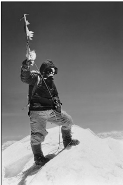
Tenzing Norgay on the summit.