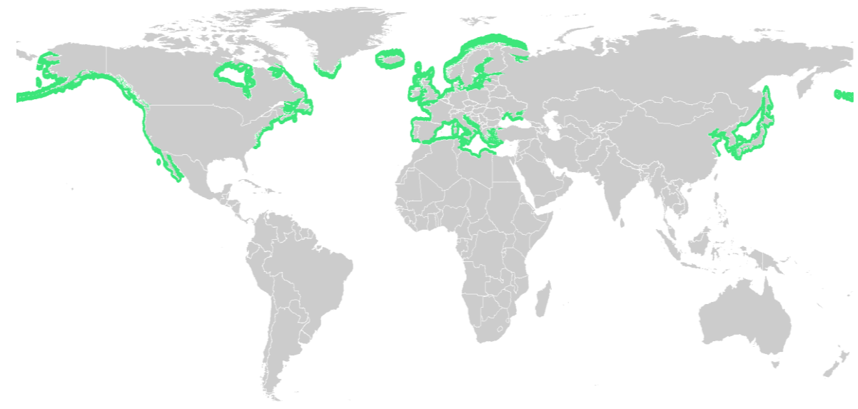
Figure 3 The global distribution of Zostera marina © ICUN