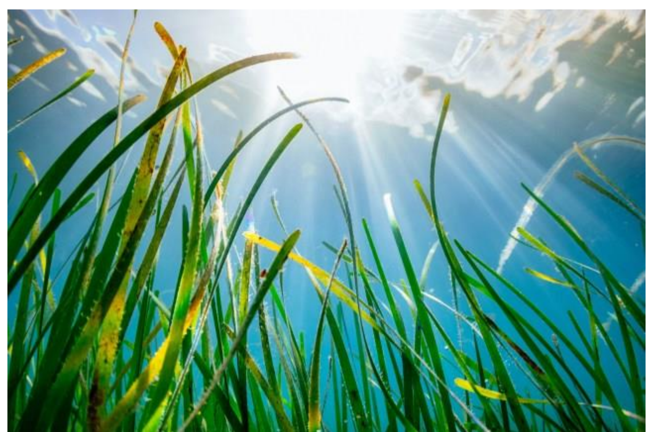
Seagrass Seagrass is a 'wonder plant' beneath the waves – the UK is saving it | Metro News

Two important functions are performed by seagrass: carbon sequestration ('sucking in' carbon from the world's oceans) and the accumulation of sediment.