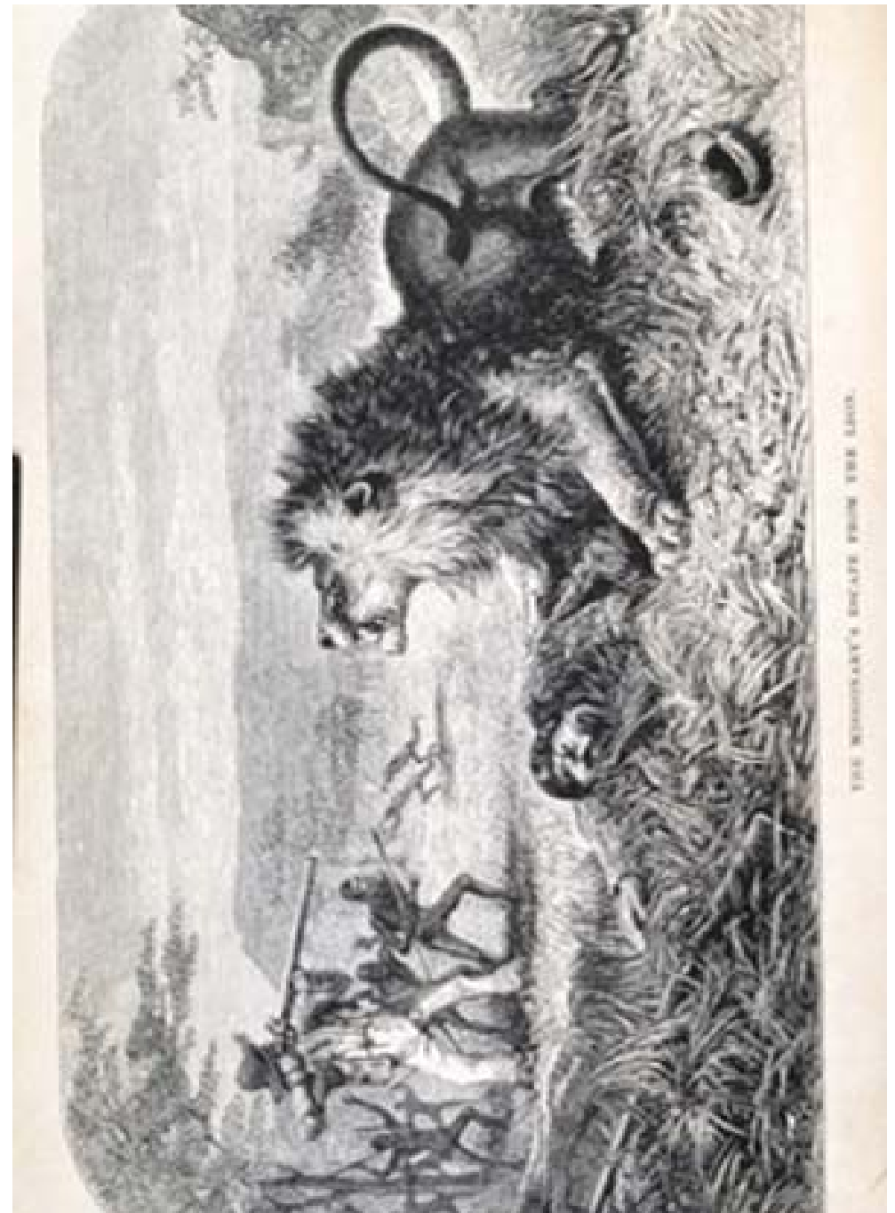
THE MISSIONARY'S ESCAPE FROM THE LION.