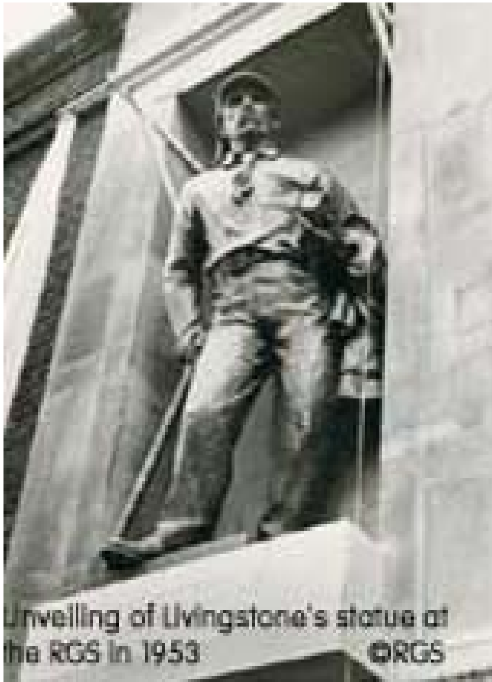
Unveiling of Livingstone's statue at the RGS in 1953