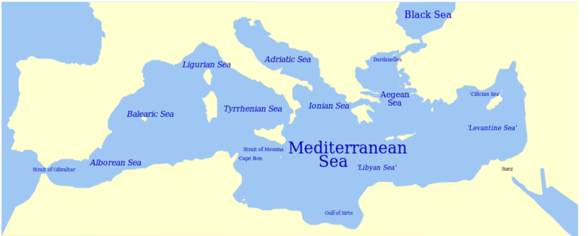
Map of the Mediterranean and subdivisions, © Wikipedia Commons

The main currents in the Mediterranean flow in from the Atlantic via the Straits of Gibraltar, travel east to the Levant, and then back along the coast of North Africa, where the water is pushed northwards towards Europe. The 'message in a bottle' follows these currents, as the water flows first towards Greece and the Balkans, then to Sicily and Italy, to France and then Spain.