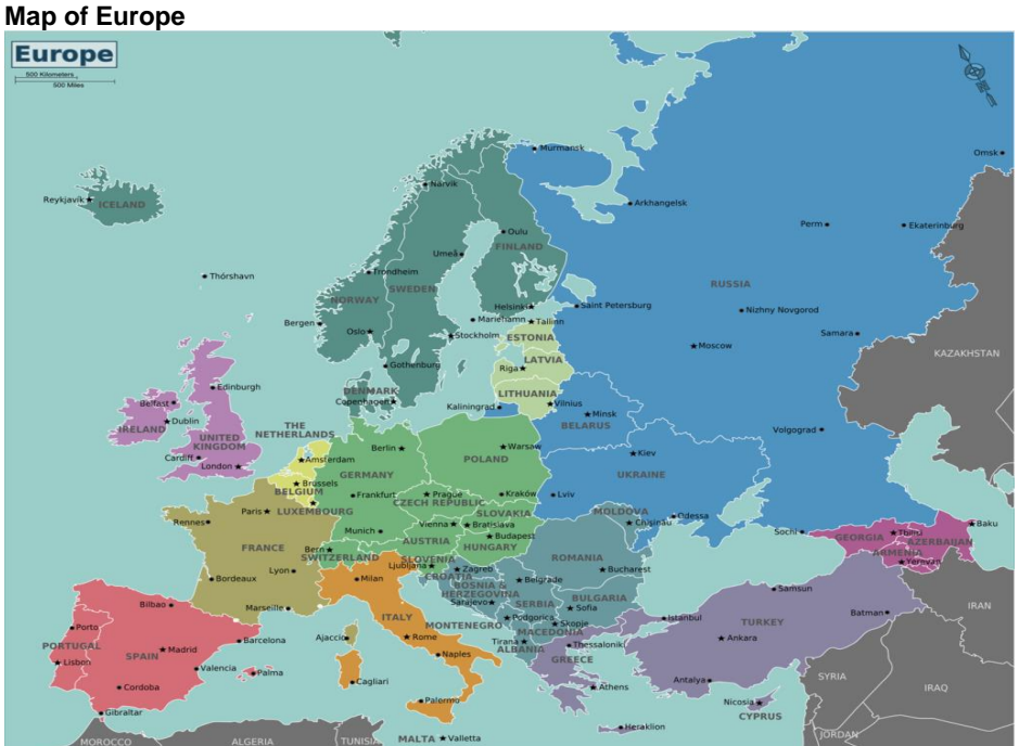
Map of Europe

There are 51 countries in Europe that are widely recognised by other states. These include the world's smallest country, Vatican City, and its largest, the Russian Federation. In addition, there are some countries – such as Kosovo – which are not as widely recognised. There are also a few dependencies and territories of larger states, such as Gibraltar (UK) and the Faroe Islands (Danemark). Both the Russian Federation and Turkey are transcontinental states: their territories can be found in both Europe and Asia.