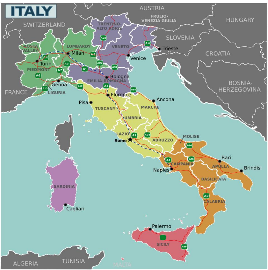
Regions of Italy