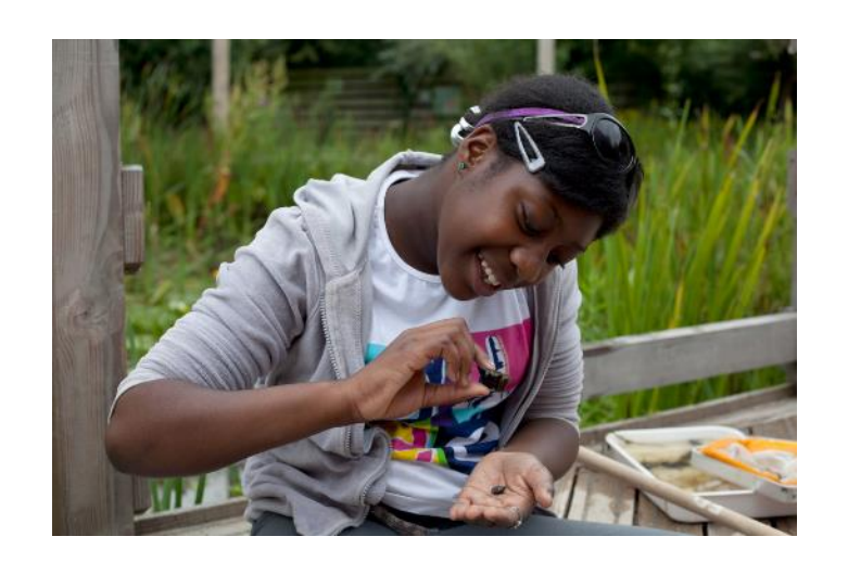
Wildlife and ecosystems as the key learning resource