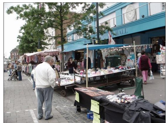
Romford Market