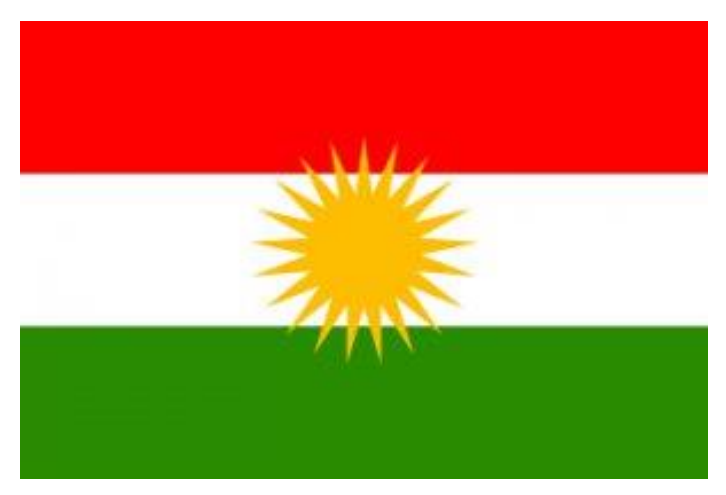
1 Source: https://unpo.org/members/7882