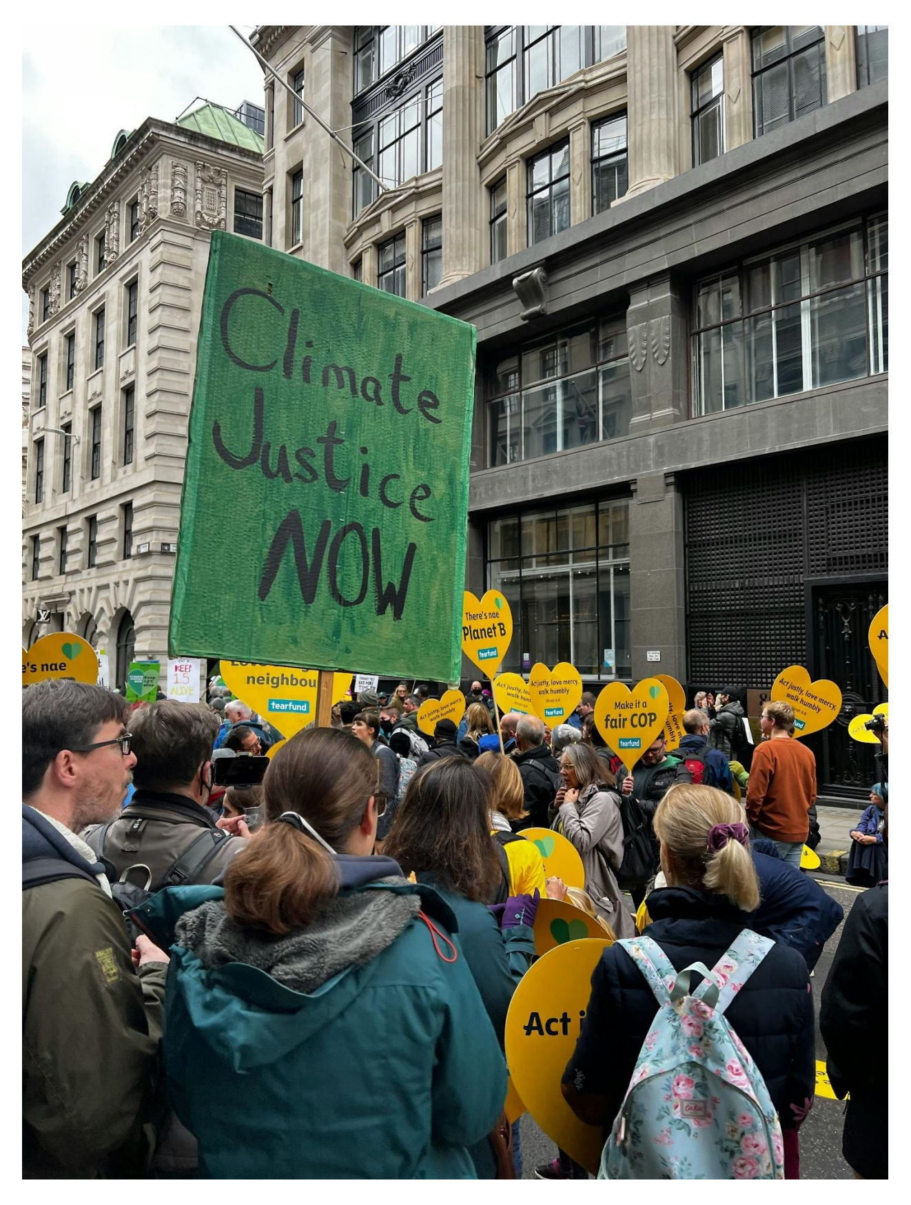
Figure 1: A typical view of environmental activism

Those engaged in environmental activism offer invaluable insights into both the physical and human elements of our world. By hearing from people who are (or were) addressing challenges from multiple angles - whether through scientific research, education, conservation efforts, or