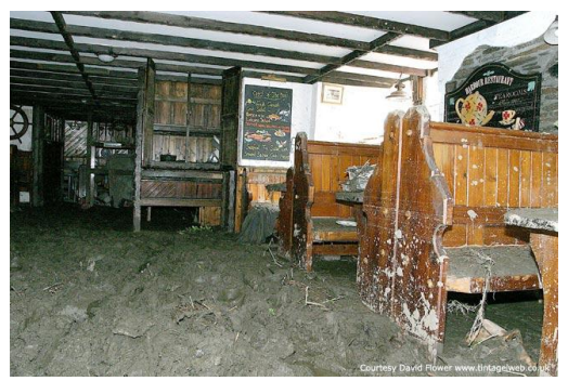
The muddy interior of a bar

swept out of kitchens as water entered properties. Six properties collapsed entirely.