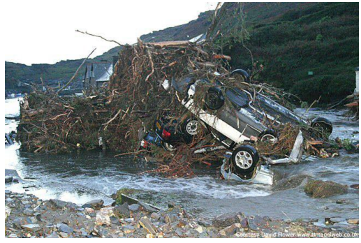
Remains of a car in the bay

The presence of people living in this area resulted in a hazard risk becoming present. Around 1,000 people live in Boscastle. The rainfall also hit at a holiday time of year when the settlement's population doubles to 2,000 - as tourists arrive, many of who are following the South West Coast Path.