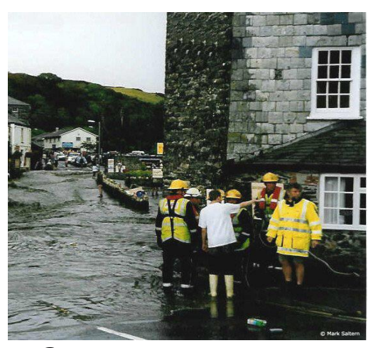
Emergency services in action

banks. At 5 p.m. the Clovelly Clothing shop was dragged 50 metres away from its site by floodwater flowing down the main street before later collapsing.