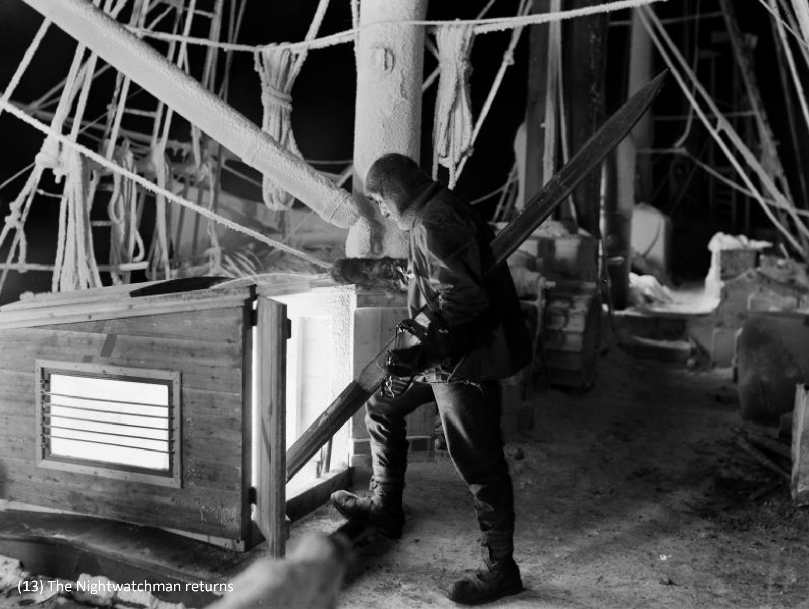
(13) The Nightwatchman returns

When compared to conventional black and white silver prints, platinum prints exhibit an expanded tonal range, three dimensionality, and a uniquely luminous, painterly quality. Unlike silver prints, where the image is floating, in a gelatin layer on top of the paper, a platinum image is part of the fine paper on which it is printed.