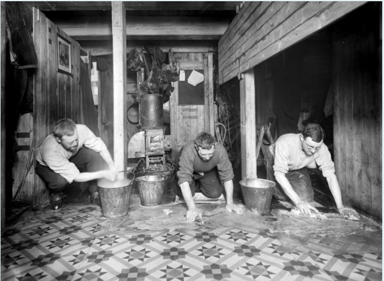
(15) The Scientists washing down the "Ritz" (living quarters in the hold)