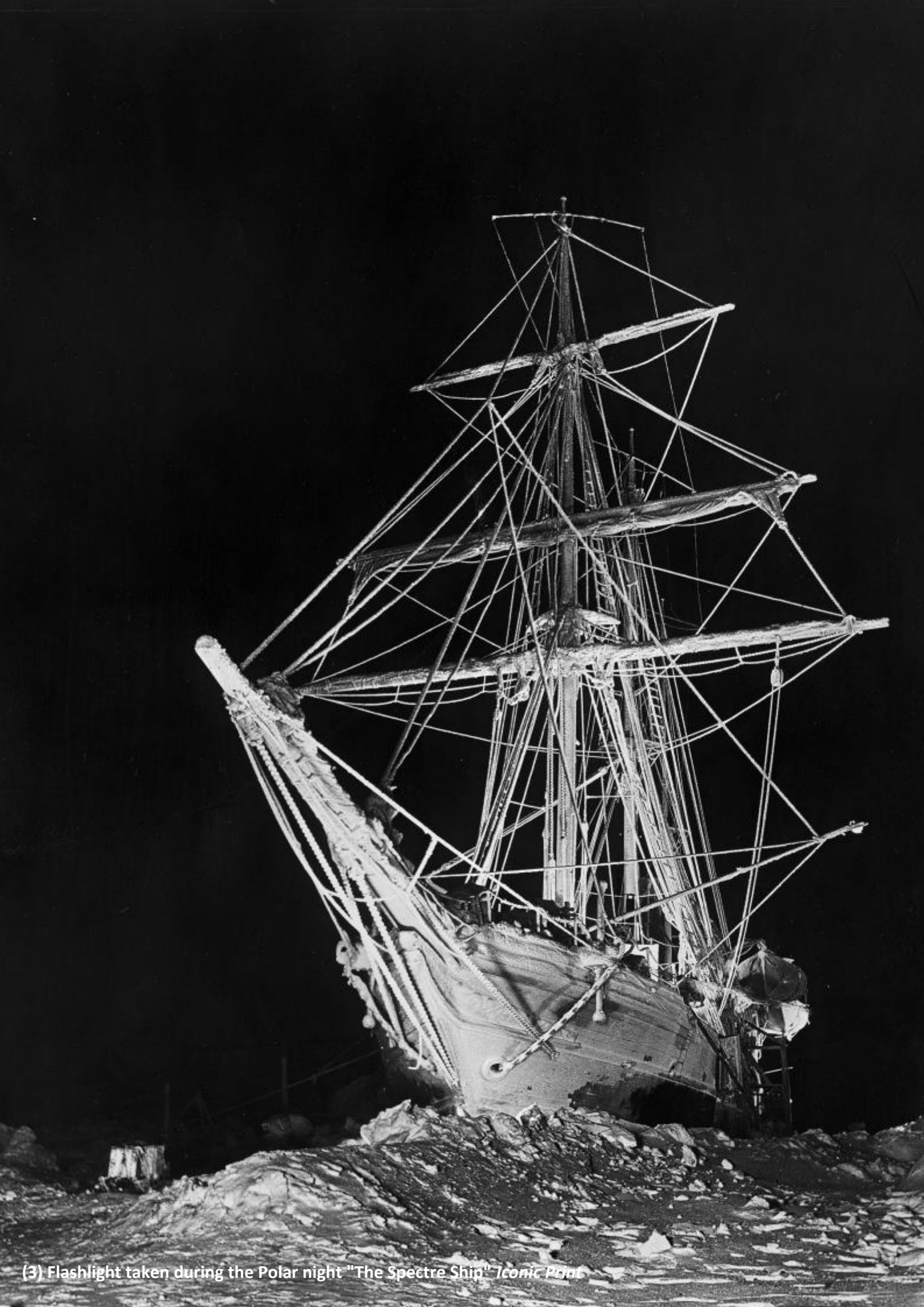
(3) Flashlight taken during the Polar night "The Spectre Ship" Iconic Print