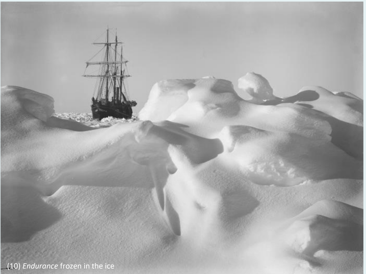
(10) Endurance frozen in the ice

The platinum technique consists in coating specially made drawing paper with a light-sensitive emulsion containing platinum salts using a special brush. The paper is then carefully dried and exposed to UV light through one or more full size contact negatives.