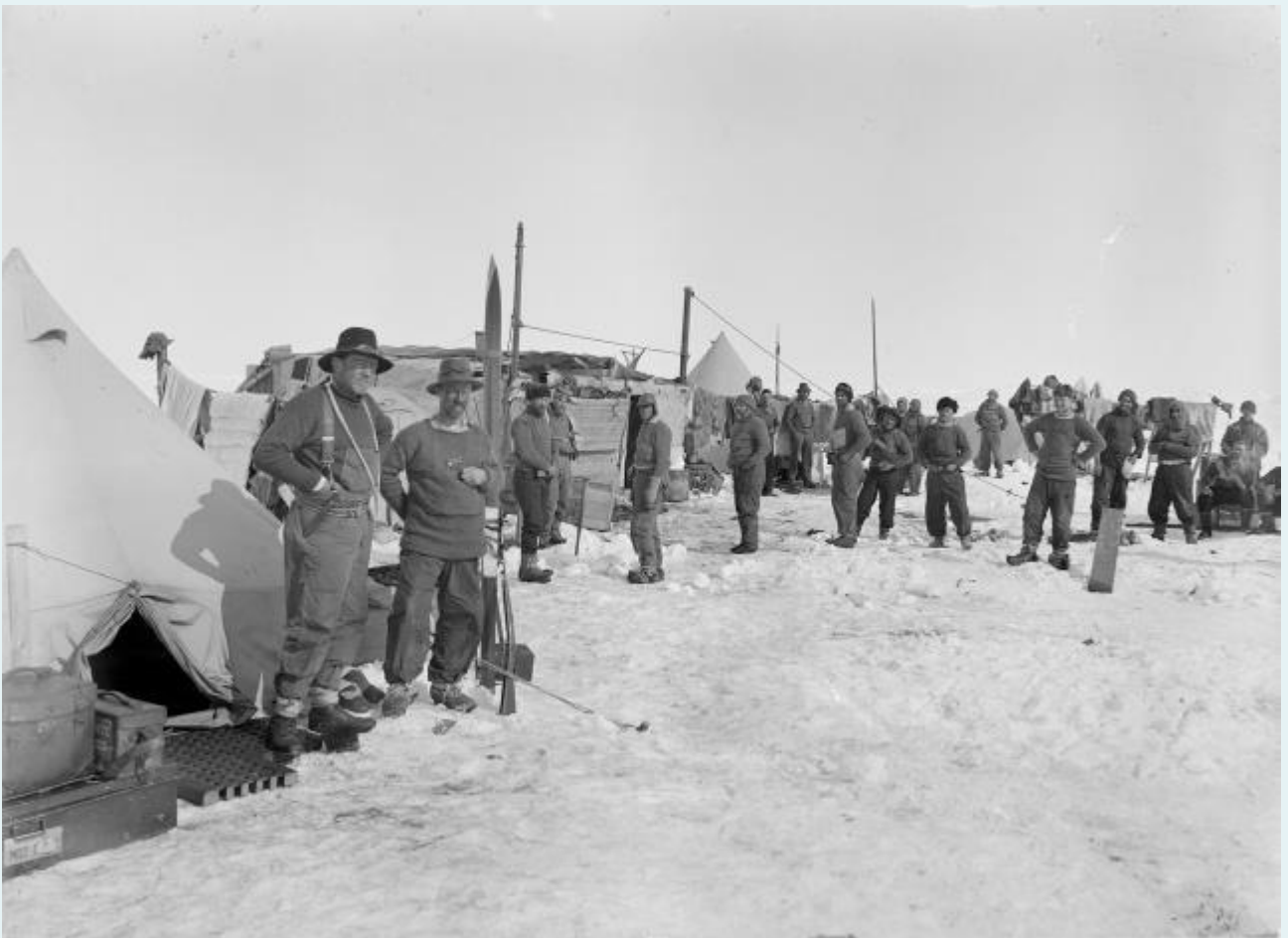
(38) On the drifting floe, 'Ocean' Camp