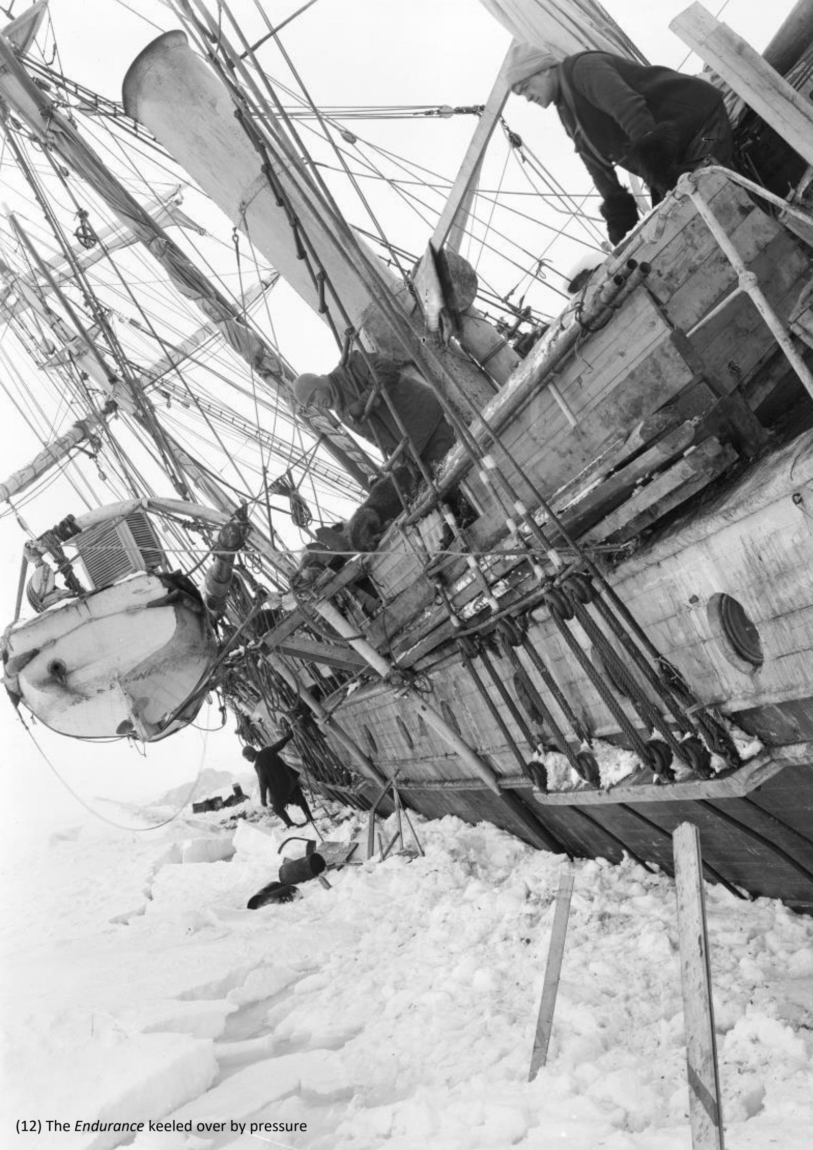
(12) The Endurance keeled over by pressure