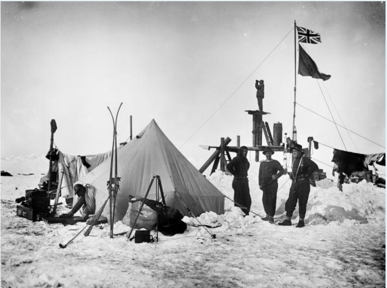
(26) The King's flag flying from the look-out platform