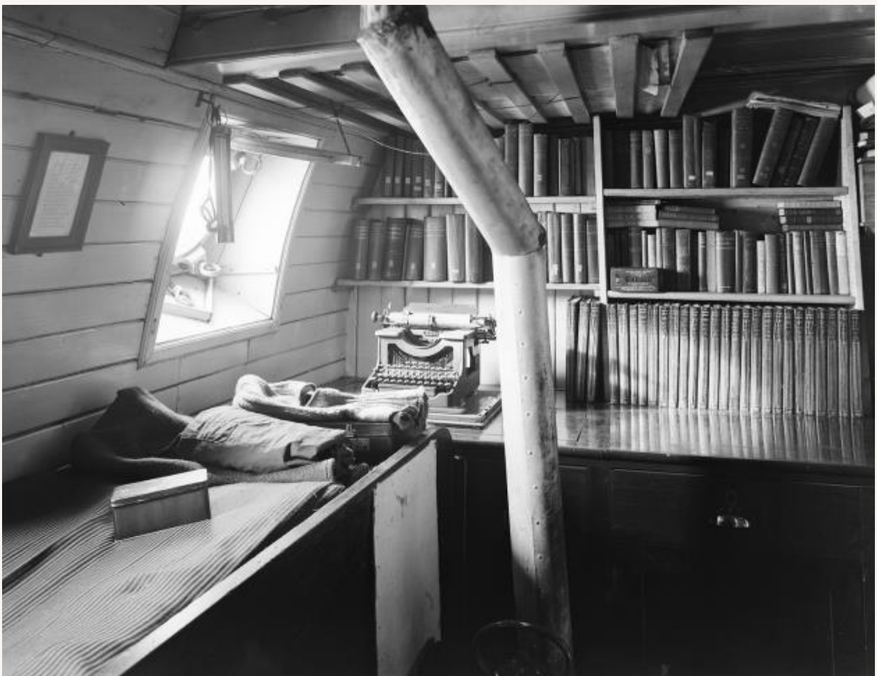
(41) Ernest Shackleton's cabin on the Endurance