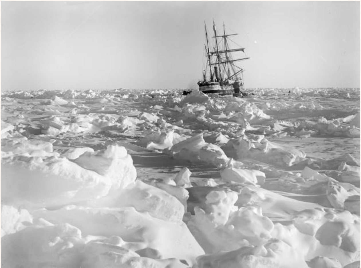
(40) Endurance in the ice