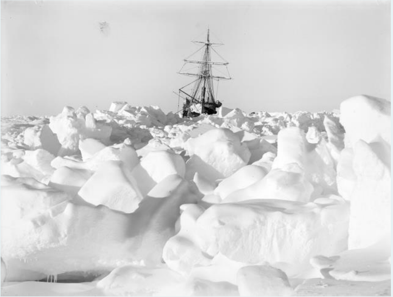
(37) Endurance in the ice