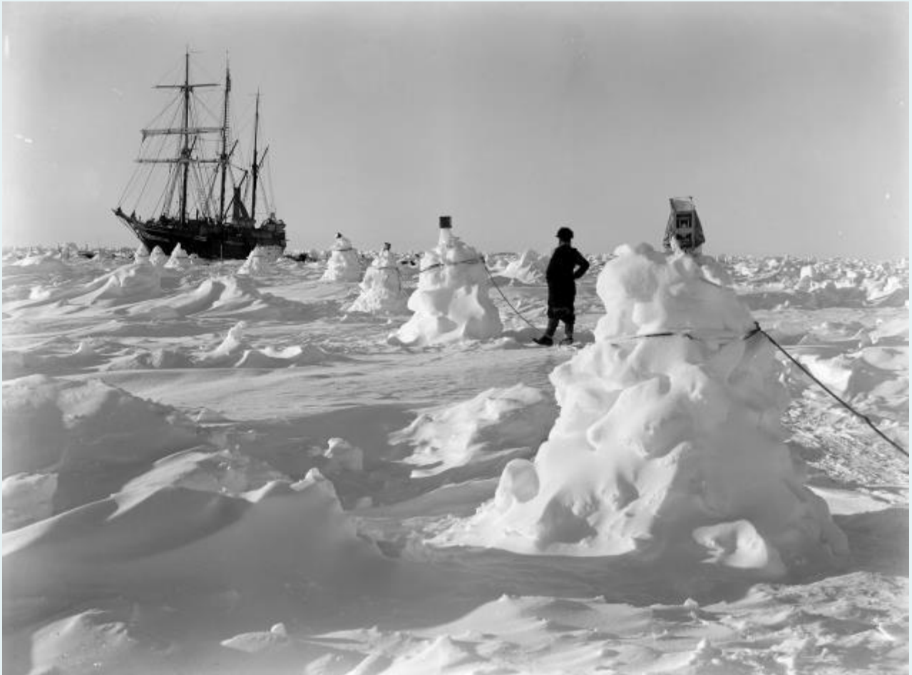
(25) Ice mounds and rope serve as guidance to crew in darkness and blizzards