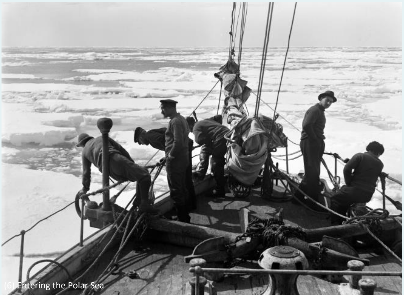
(6) Entering the Polar Sea