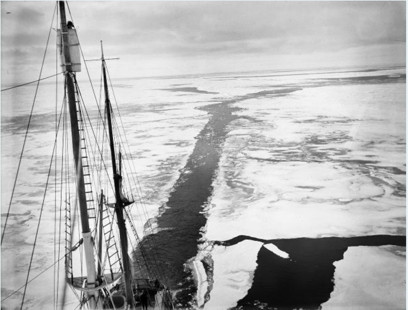
(14) Mast of the Endurance with the wake of the ship through a field of young ice