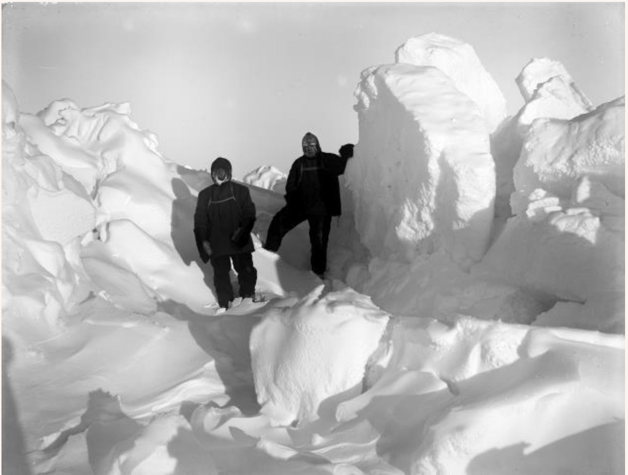
(28) Ernest Shackleton (right) and Frank Wild (left) scouting for a path to the land through the hummocks