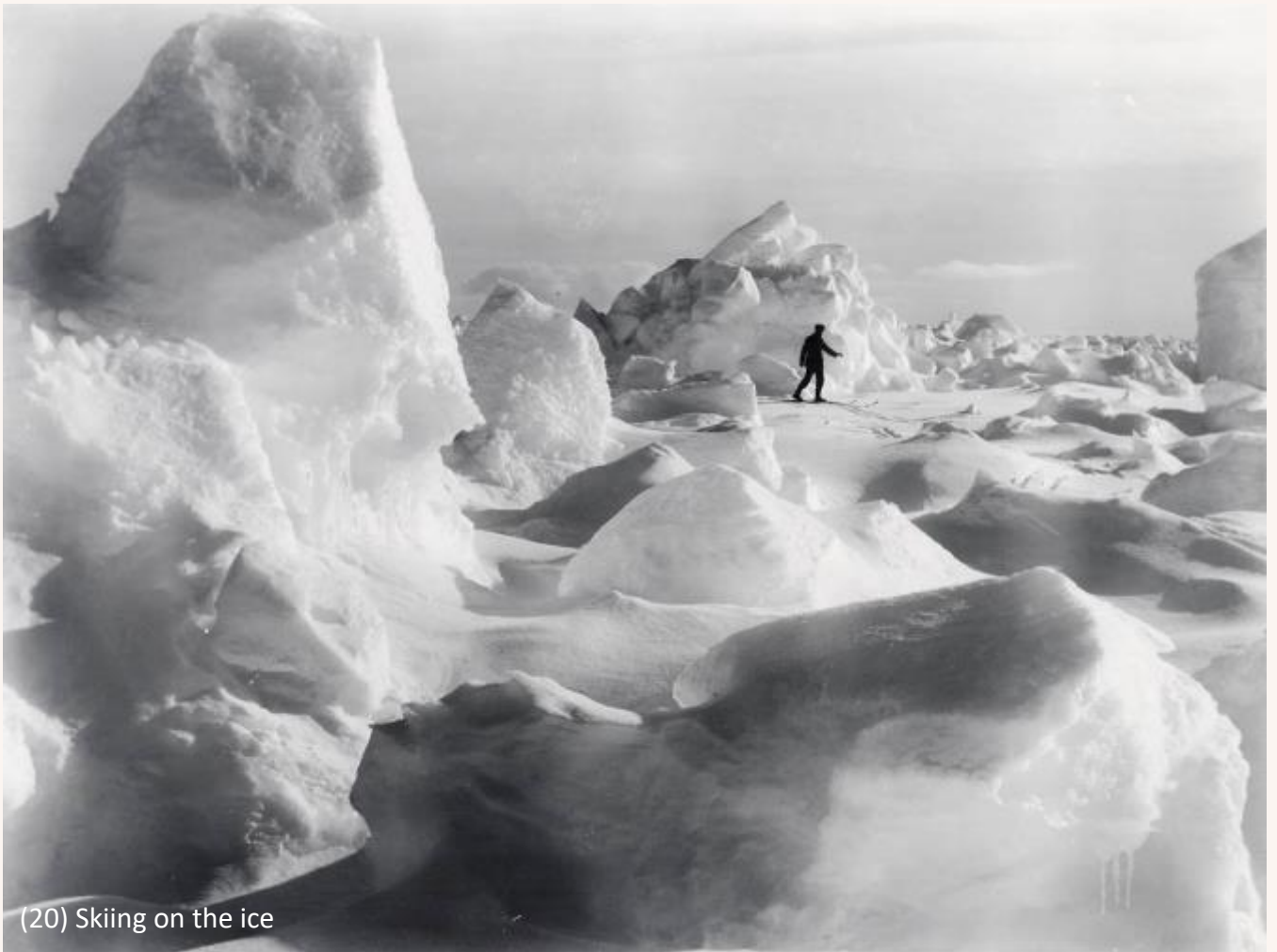
(20) Skiing on the ice