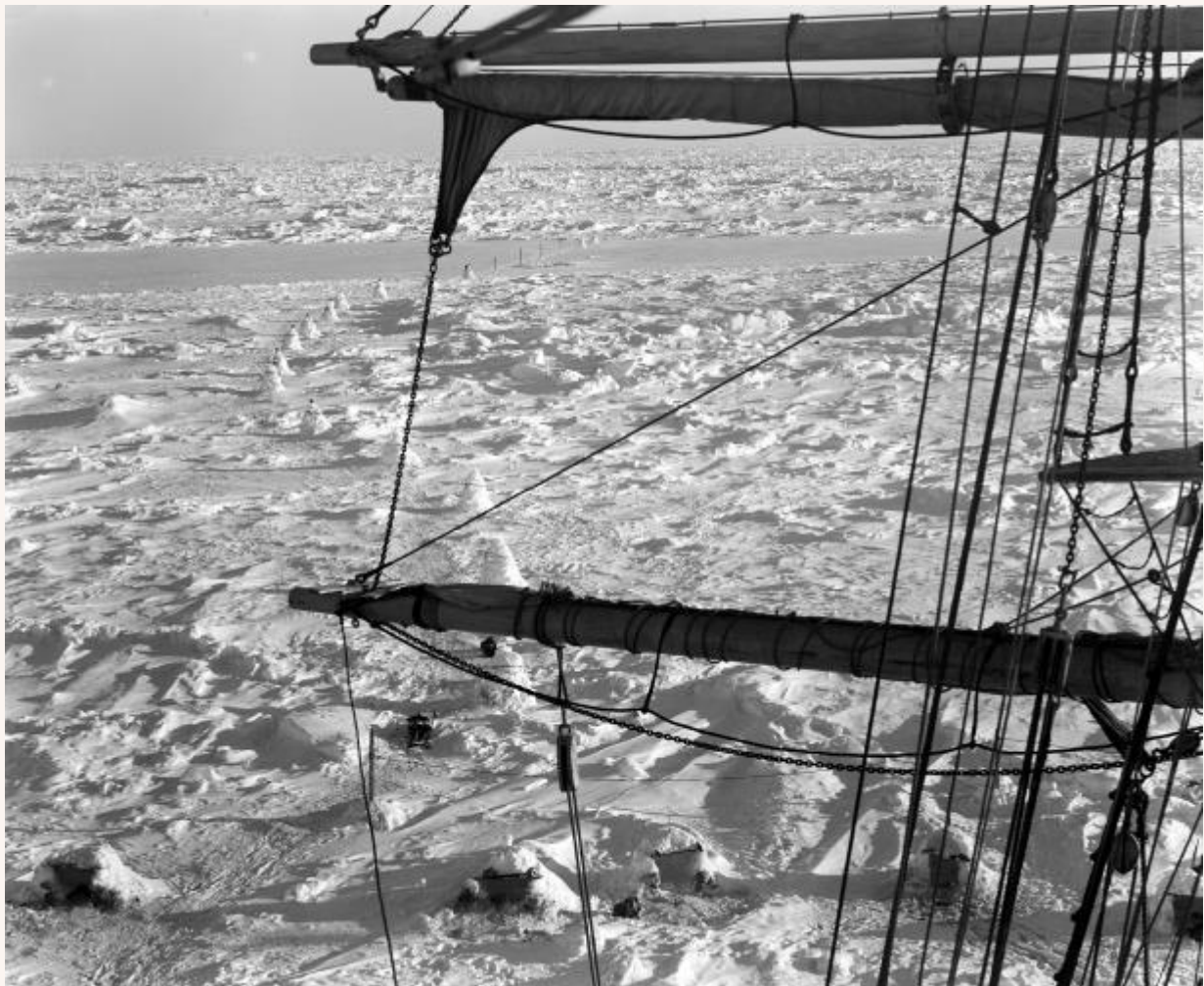
(32) The mast of the Endurance and the pylon way on the ice