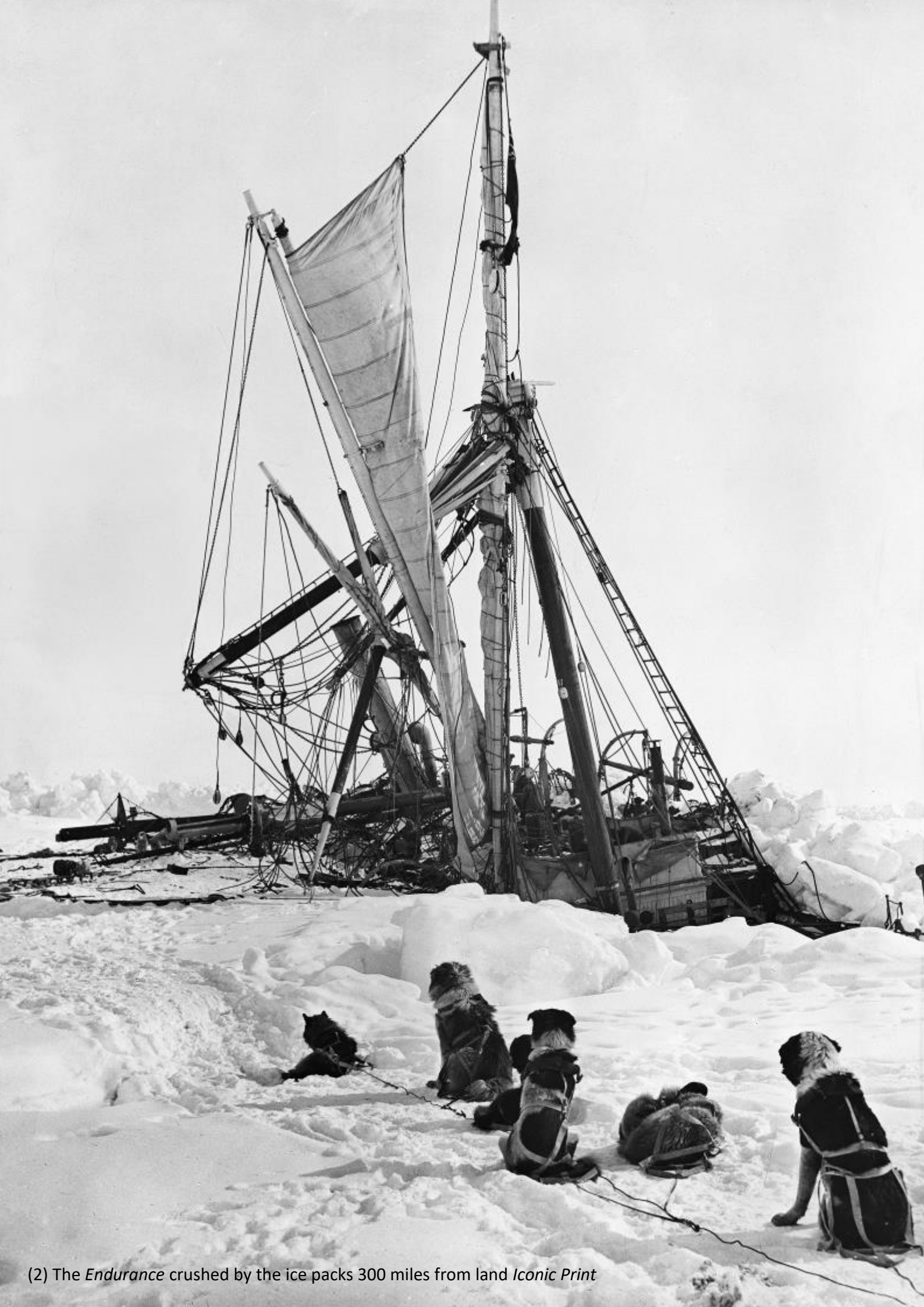
(2) The Endurance crushed by the ice packs 300 miles from land Iconic Print