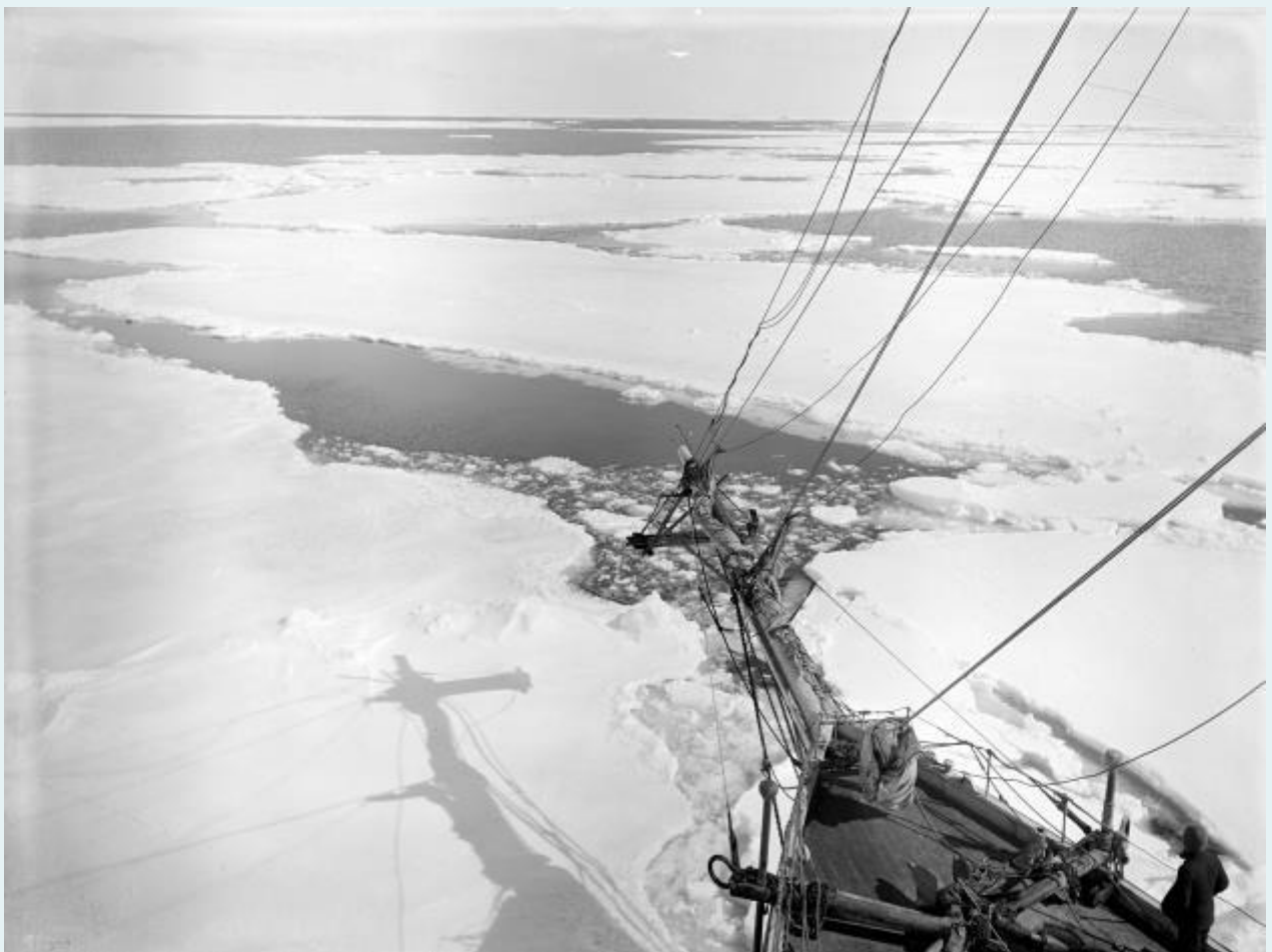
(36) The bow of the Endurance enters the ice