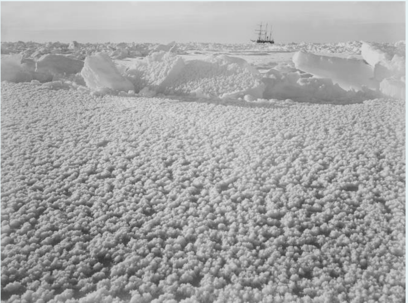
(17) Crystal ice flowers on the surface of the newly frozen ice, with Endurance frozen behind