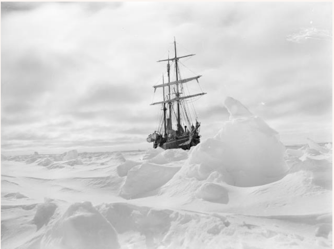
(29) Endurance frozen in the ice