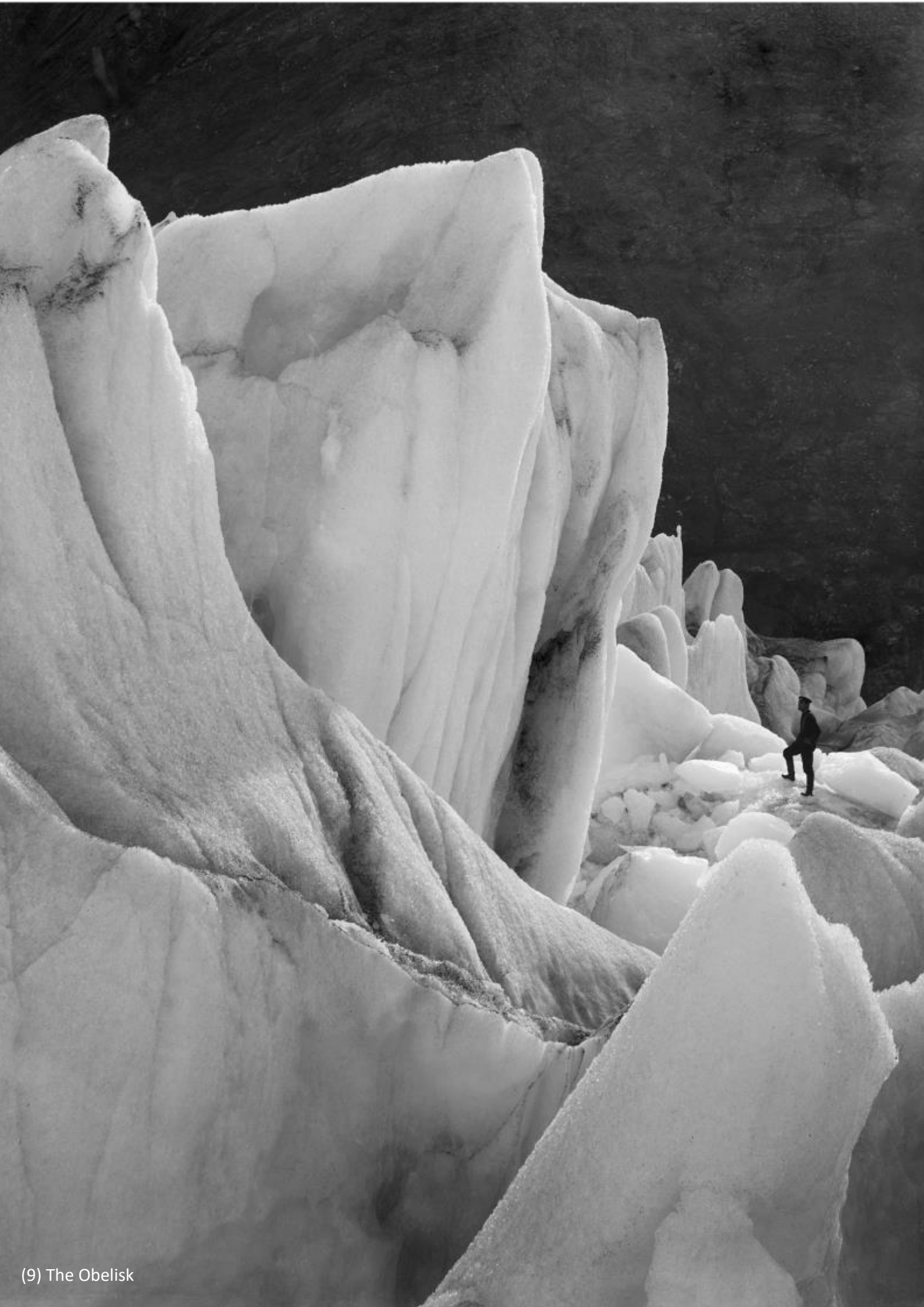
(9) The Obelisk