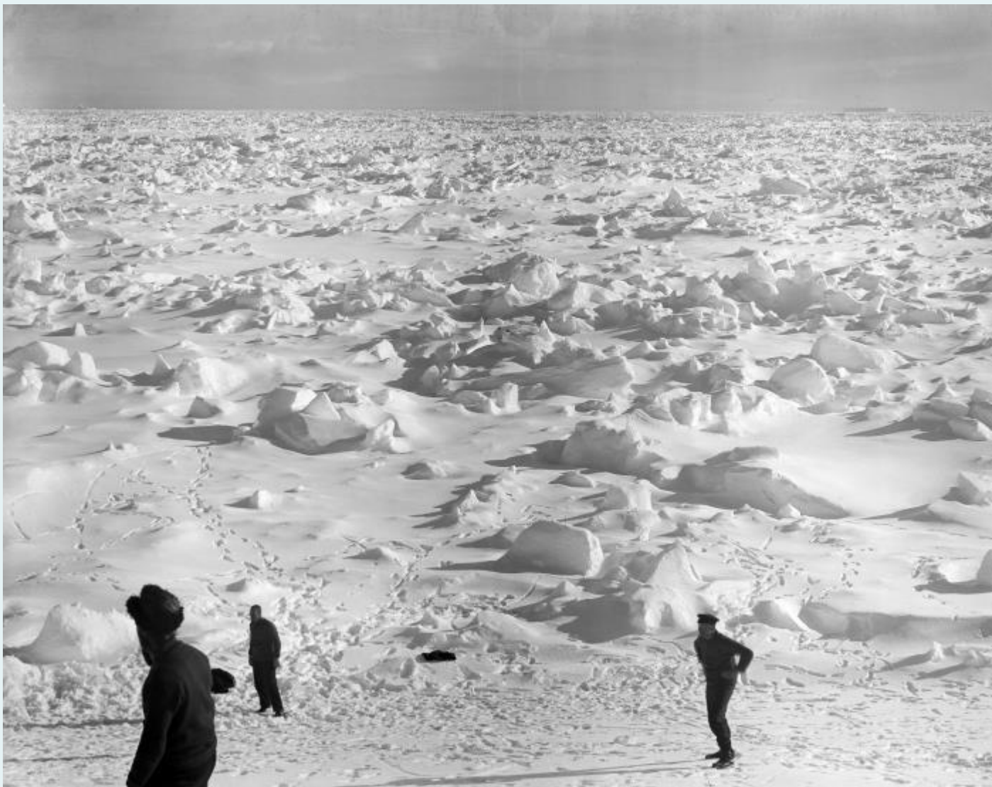
(42) 14th January, 74 degrees 10 South- 27 degrees 10 west