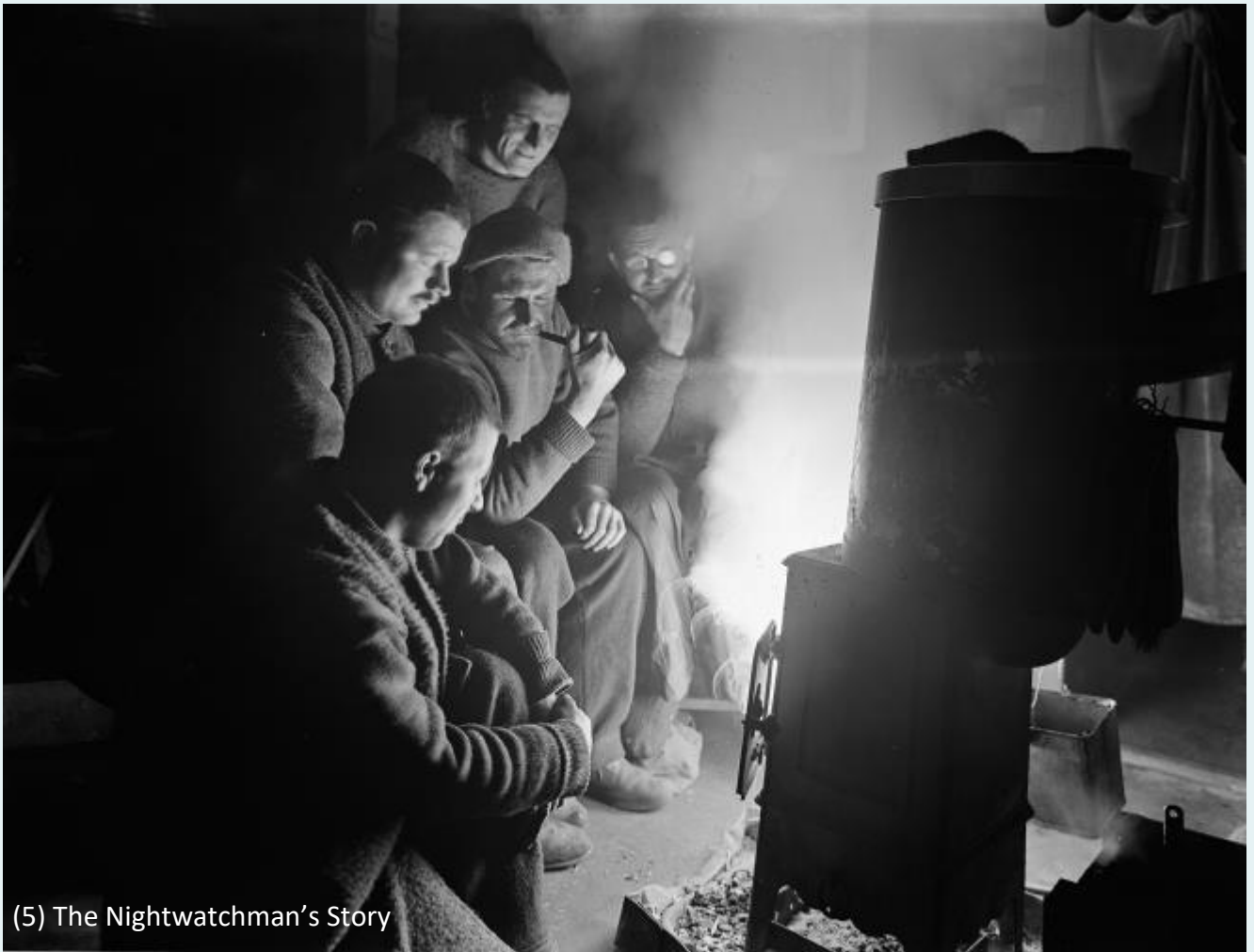
(5) The Nightwatchman's Story