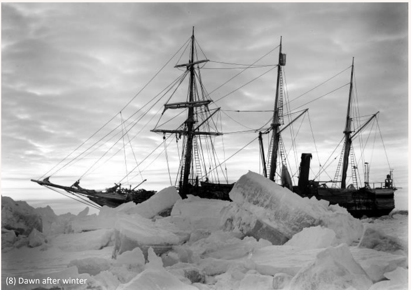
(8) Dawn after winter