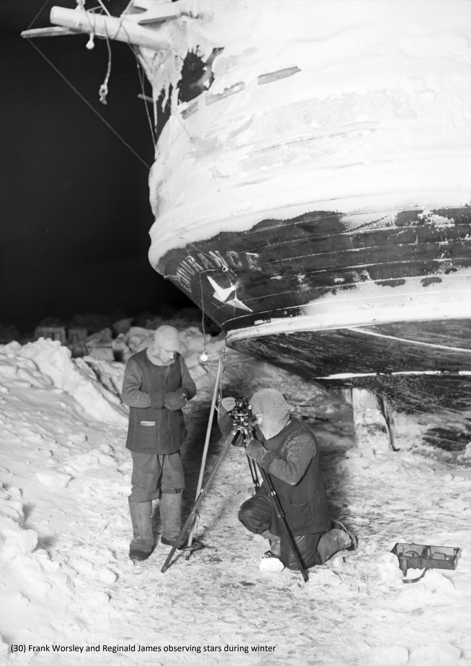
(30) Frank Worsley and Reginald James observing stars during winter