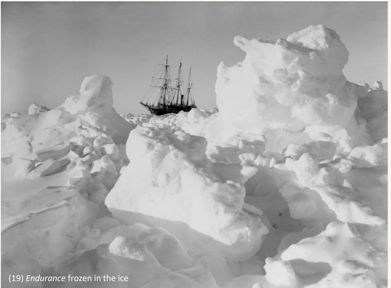
(19) Endurance frozen in the ice