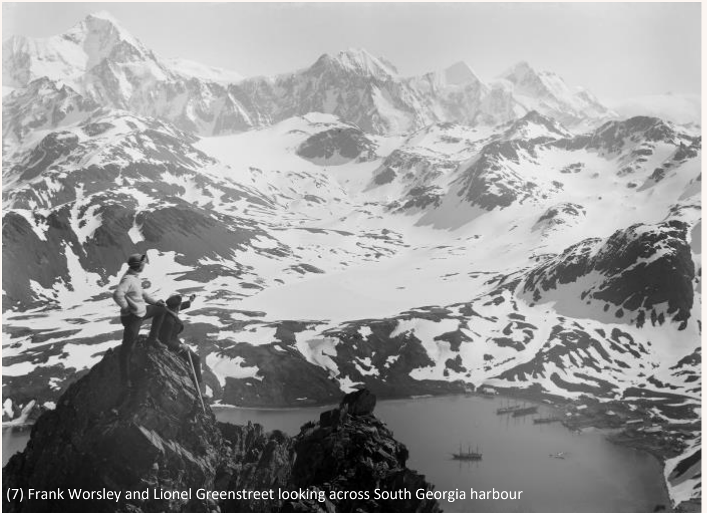
(7) Frank Worsley and Lionel Greenstreet looking across South Georgia harbour