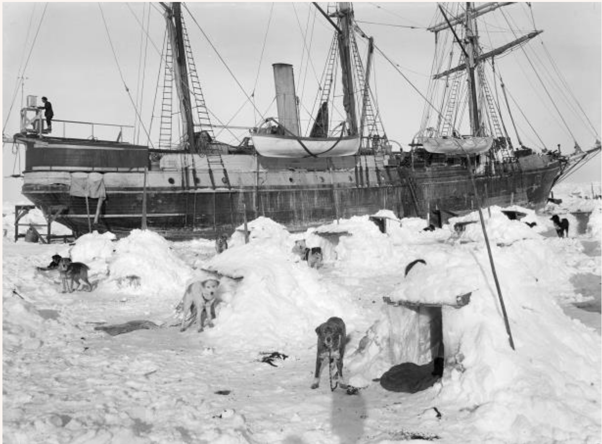
(31) Kennels on the ice in the form of igloos ('dogloos')