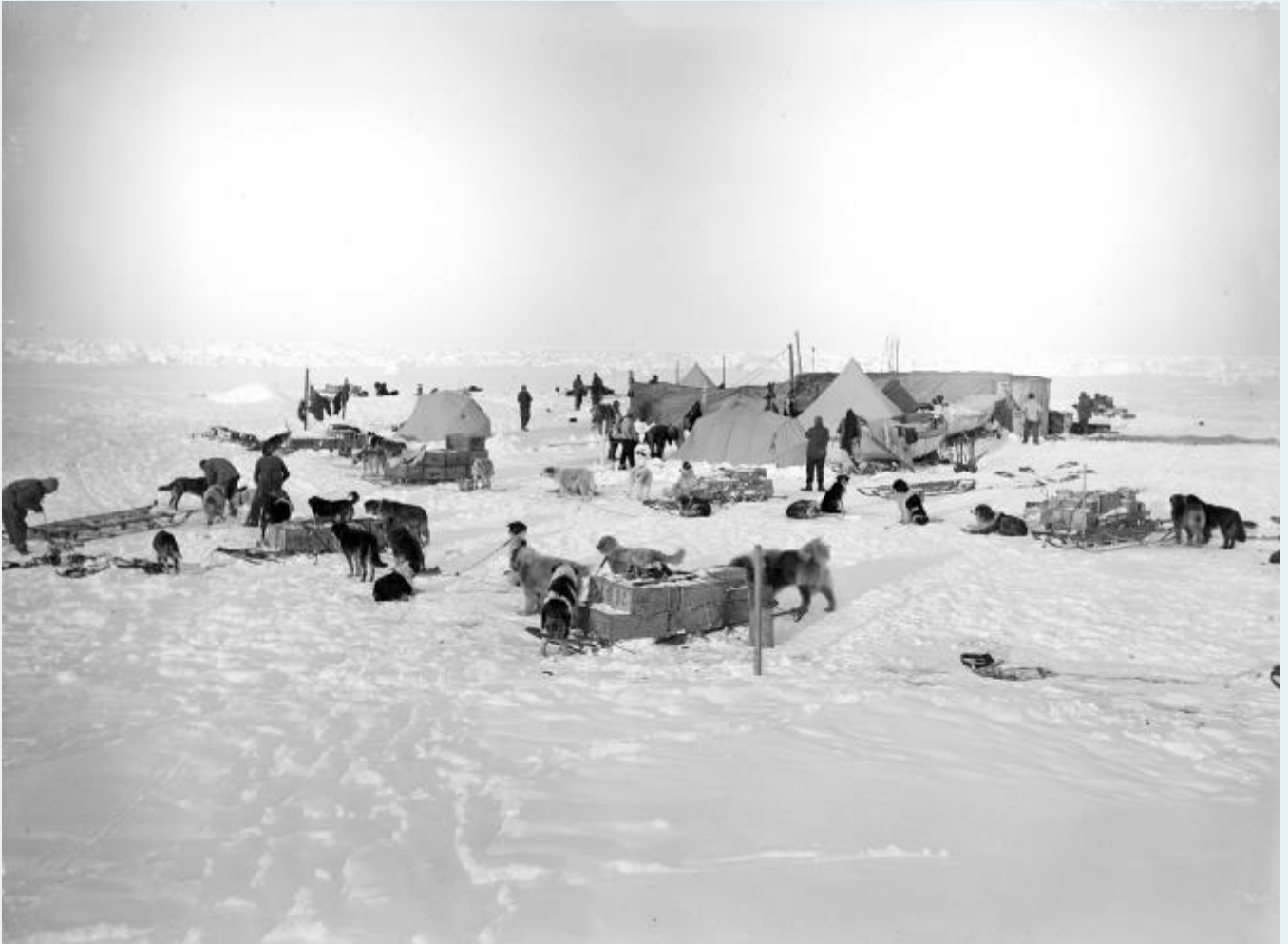
(16) Camp on the ice