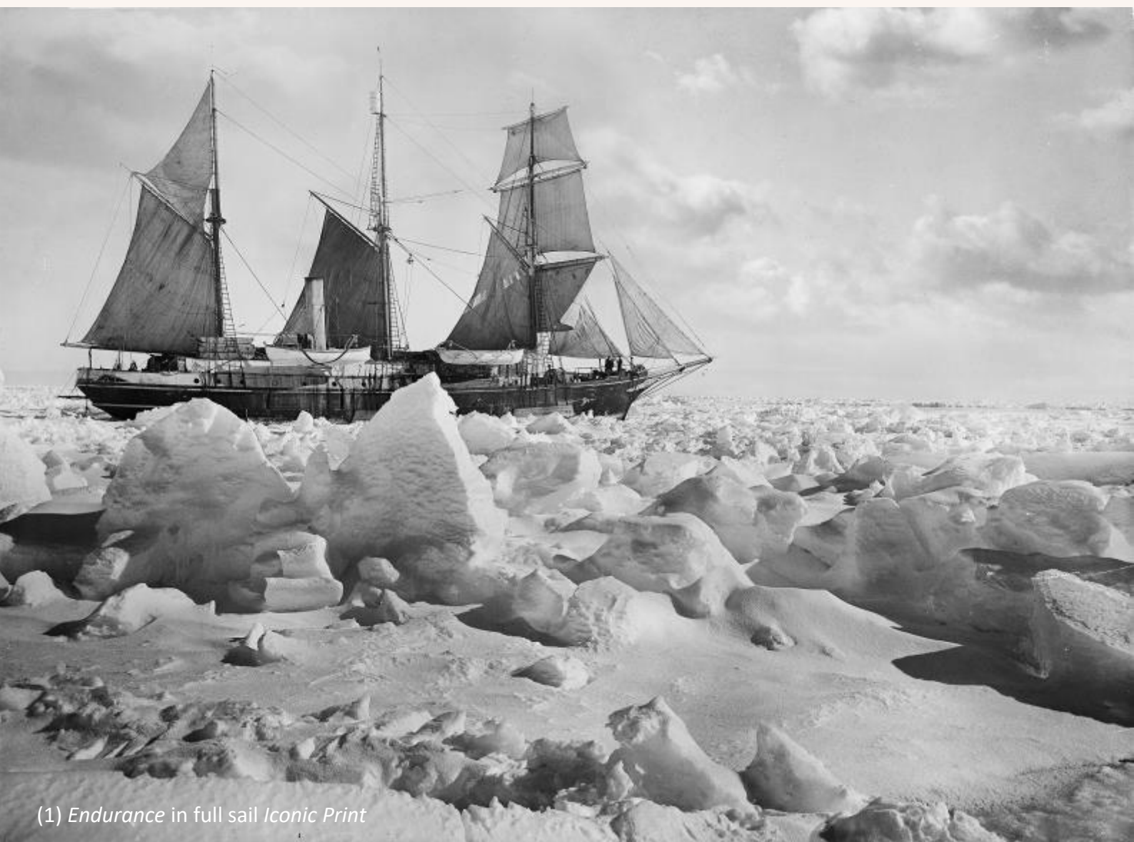
(1) Endurance in full sail Iconic Print

A century later, this iconic collection which documents one of the greatest stories of human survival, has been digitally mastered by leading experts direct from negatives for the first time, using today's most advanced custom-made technology. The result: the highest quality of image achievable using every detail contained in Hurley's original negatives, from which prints can now be produced, that surpass those made by Hurley's own hand one hundred years ago.