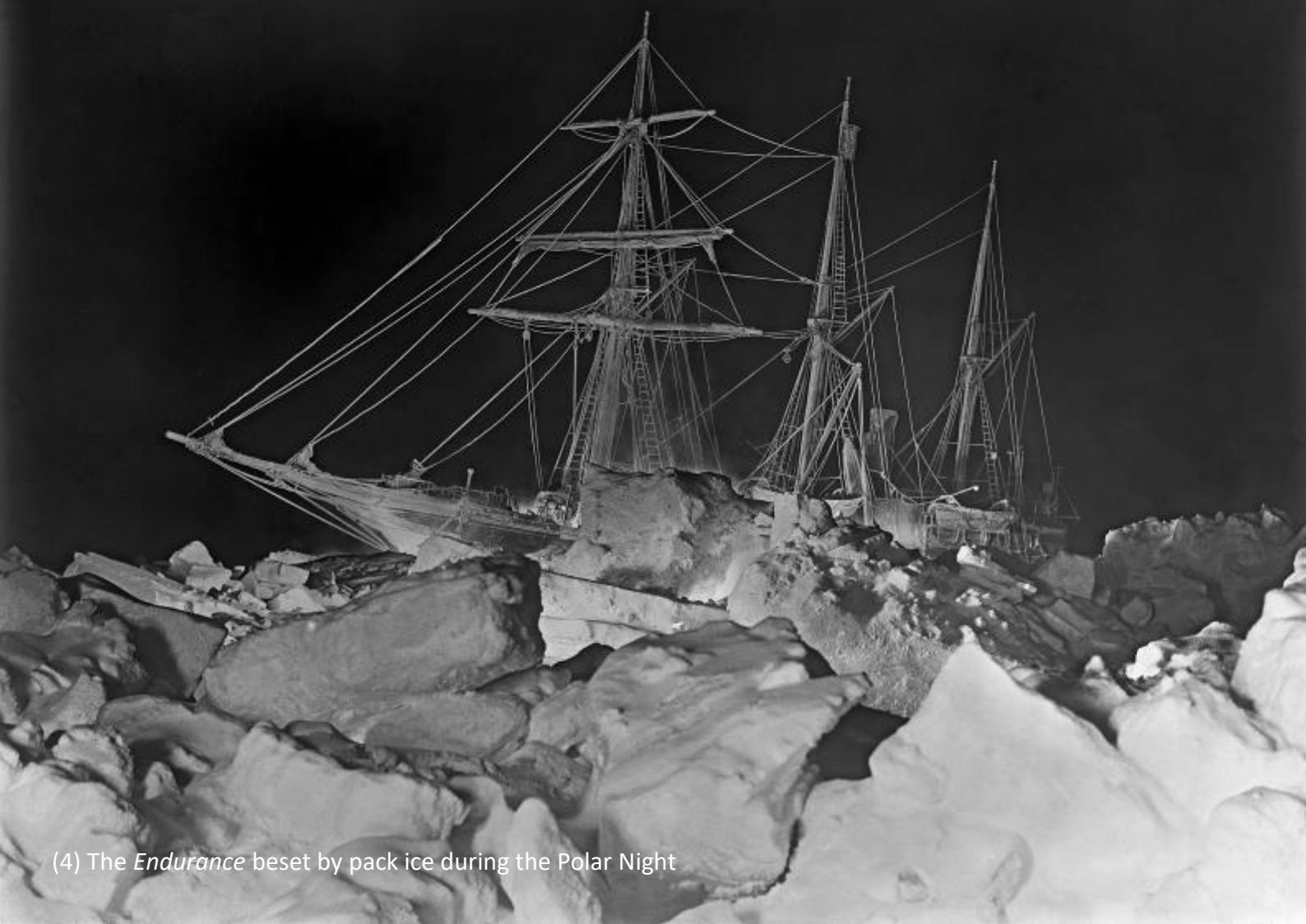
(4) The Endurance beset by pack ice during the Polar Night