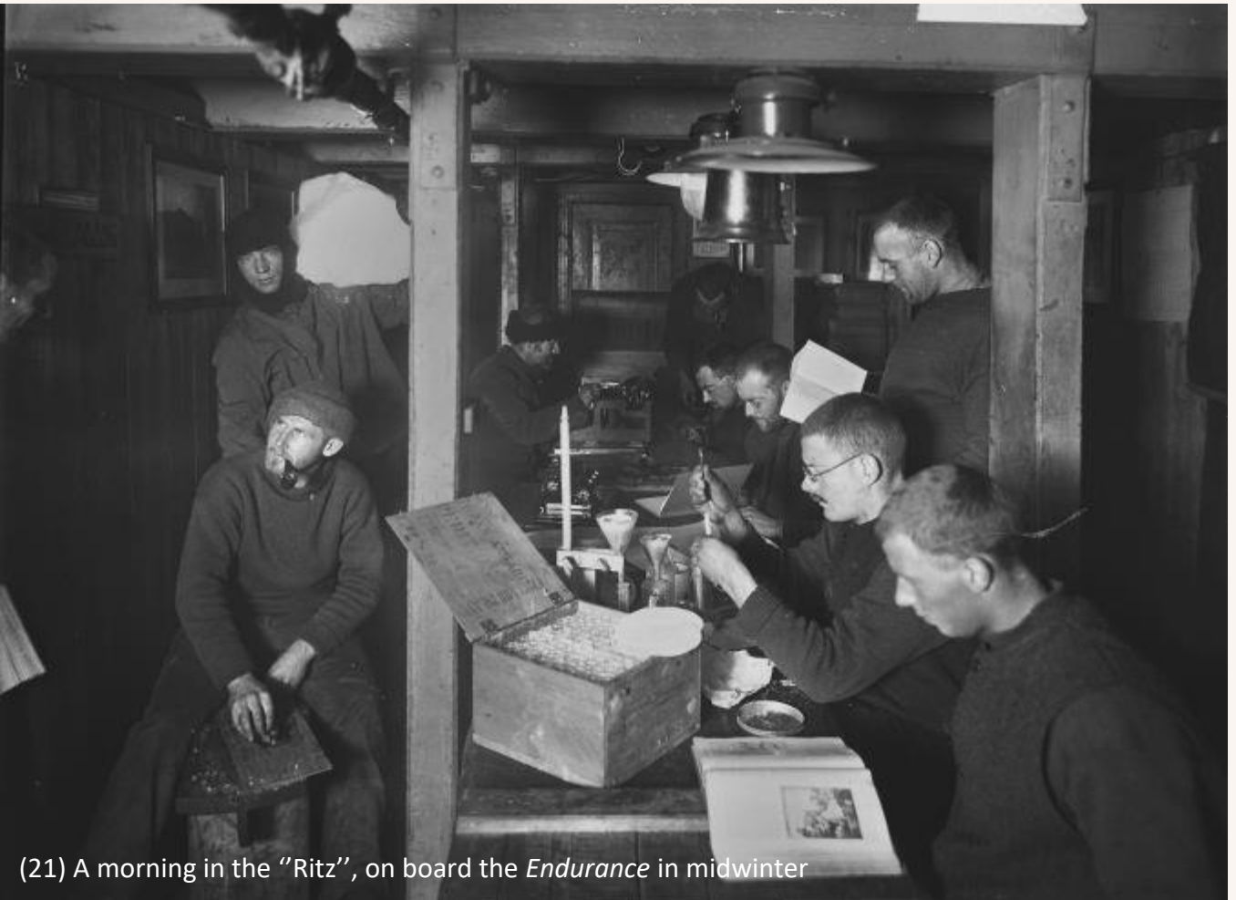
(21) A morning in the "Ritz", on board the Endurance in midwinter