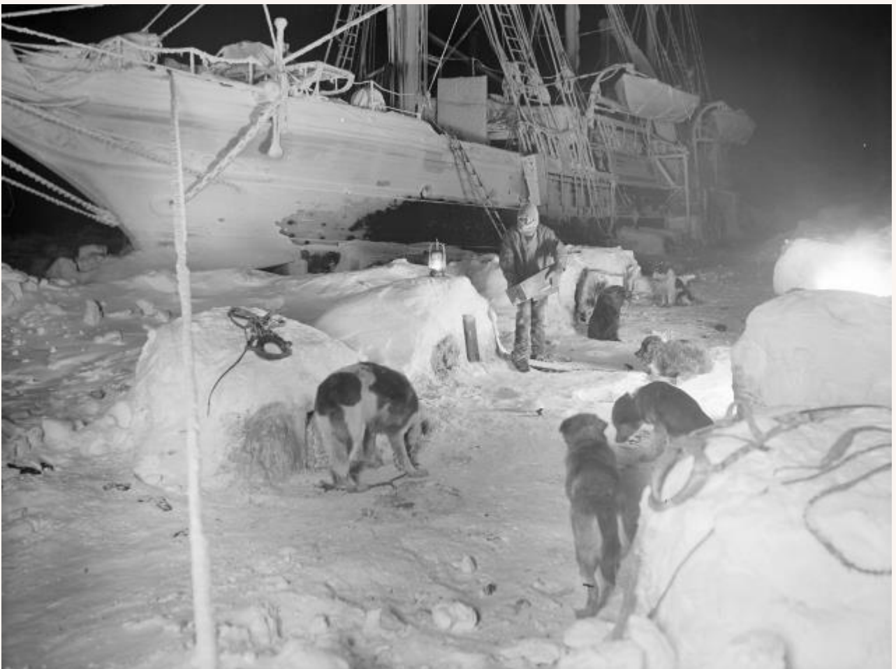
(34) Kennels and dogs on the ice at night