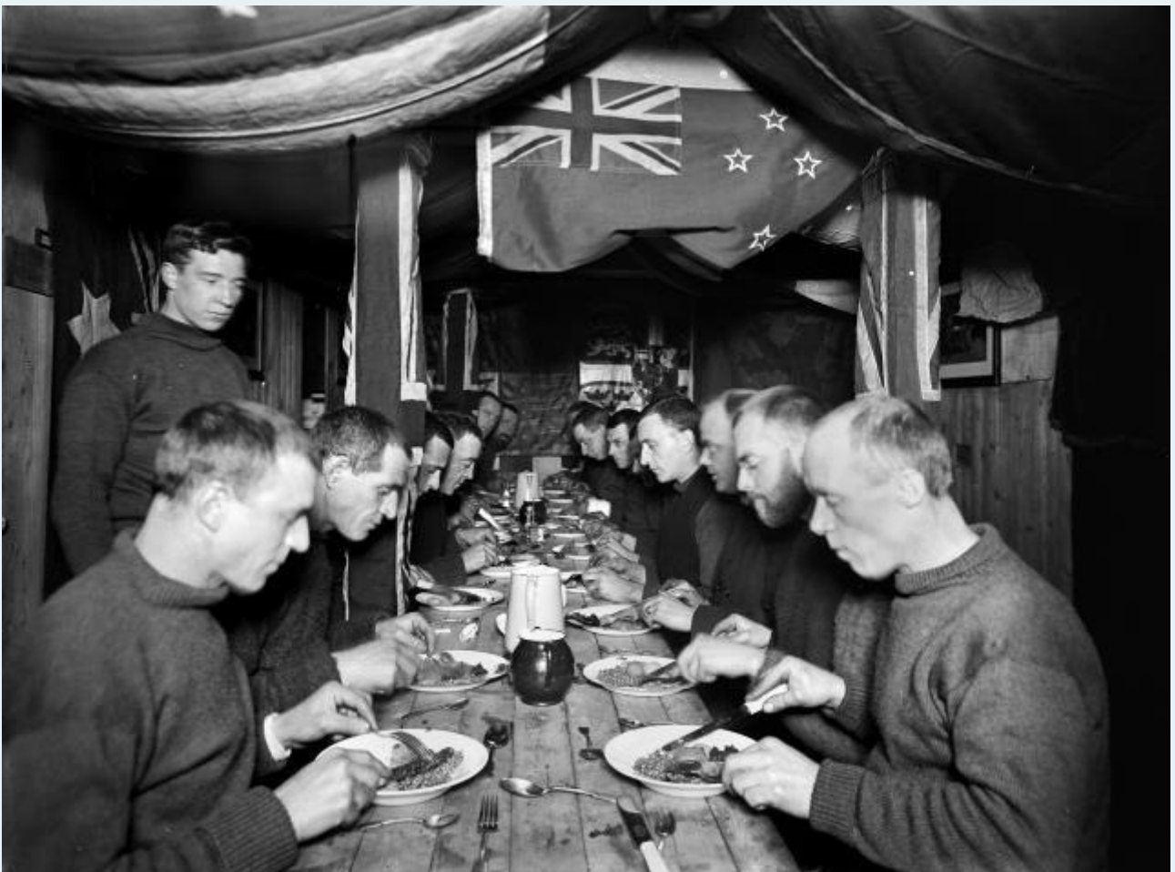
(27) Mid-winter Dinner