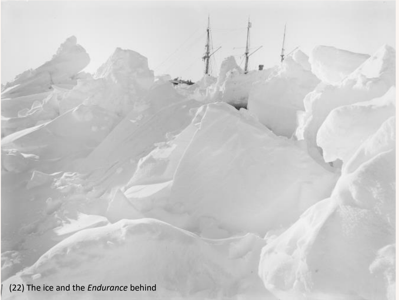
(22) The ice and the Endurance behind