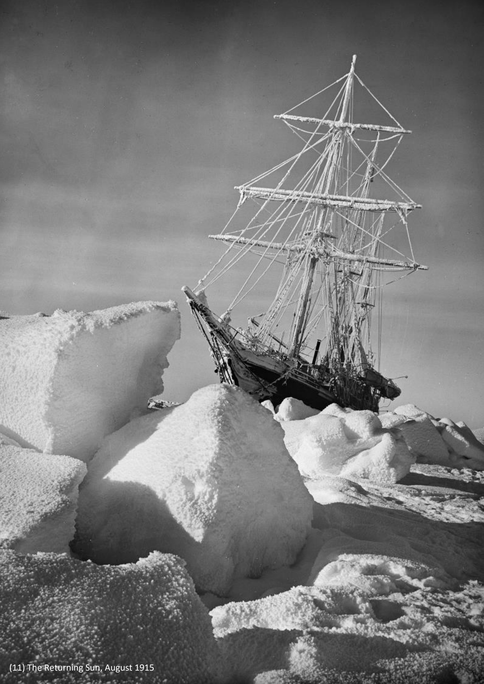
(11) The Returning Sun, August 1915