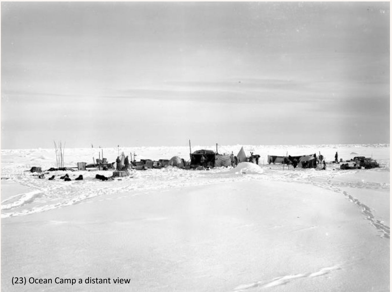
(23) Ocean Camp a distant view