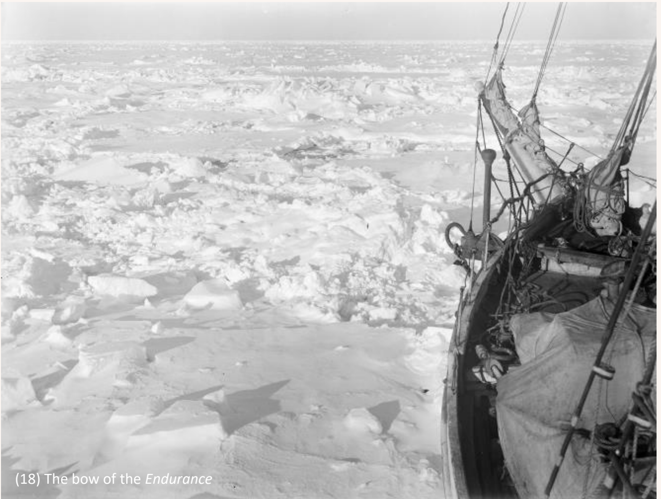
(18) The bow of the Endurance