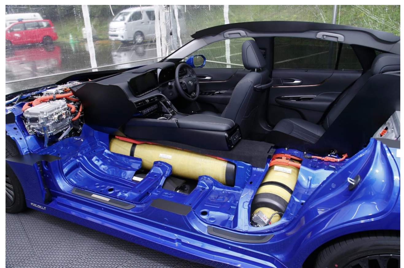
Figure 1 the Toyota Mirai. The yellow tanks are for storing hydrogen. The fuel cells are located in the engine bay