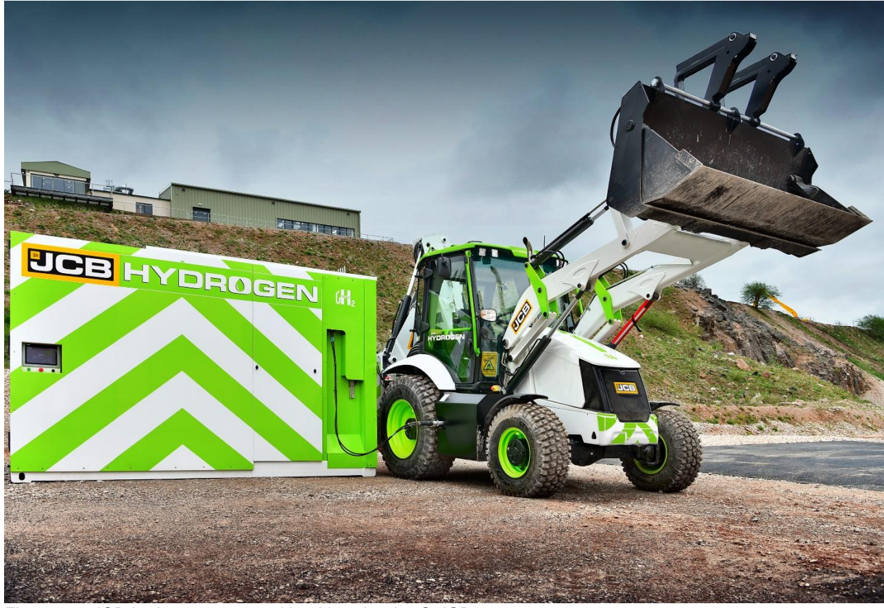
Figure 2 a JCB hydrogen-powered backhoe loader