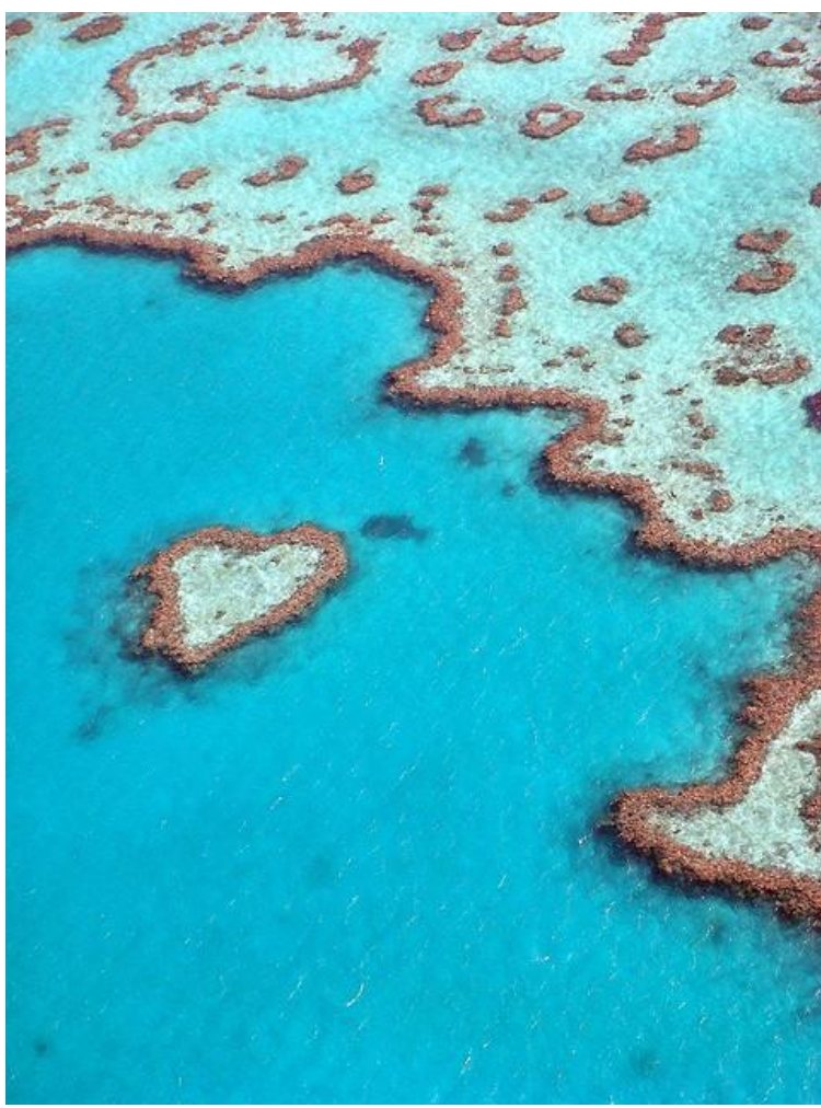
Great Barrier Reef