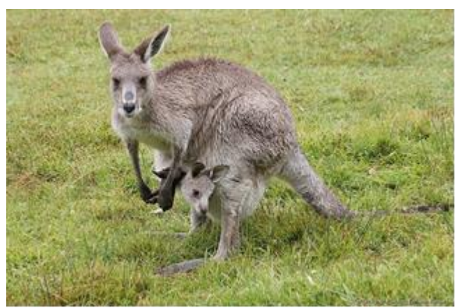
Kangaroo with joey inside the pouch

Australia also has a number of dangerous and poisonous sea creatures, animals, snakes and spiders, such as the Great White shark, the Box Jellyfish, Cone shells, the Saltwater Crocodile, the Indian Taipan snake and the Funnel Web spider.