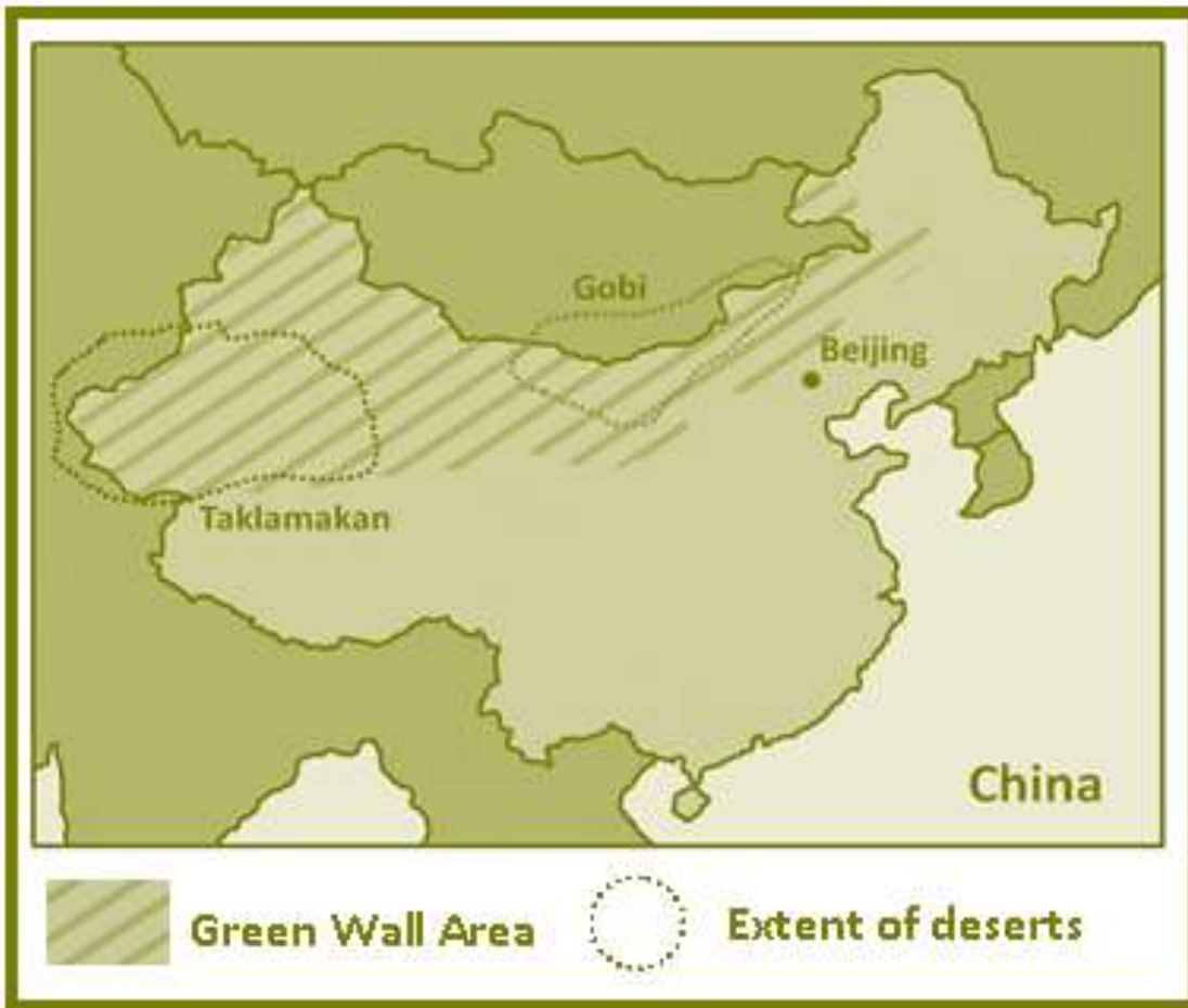
Figure 1: The Great Green Wall, China

The planting of these trees started in 1978 and is due to be completed in 2050. At that time it is estimated the programme's tree belt will stretch for 4500km, encompass 100 billion trees and will be the world's largest ecological engineering project. The 'wall' is already the world's largest artificial forest.