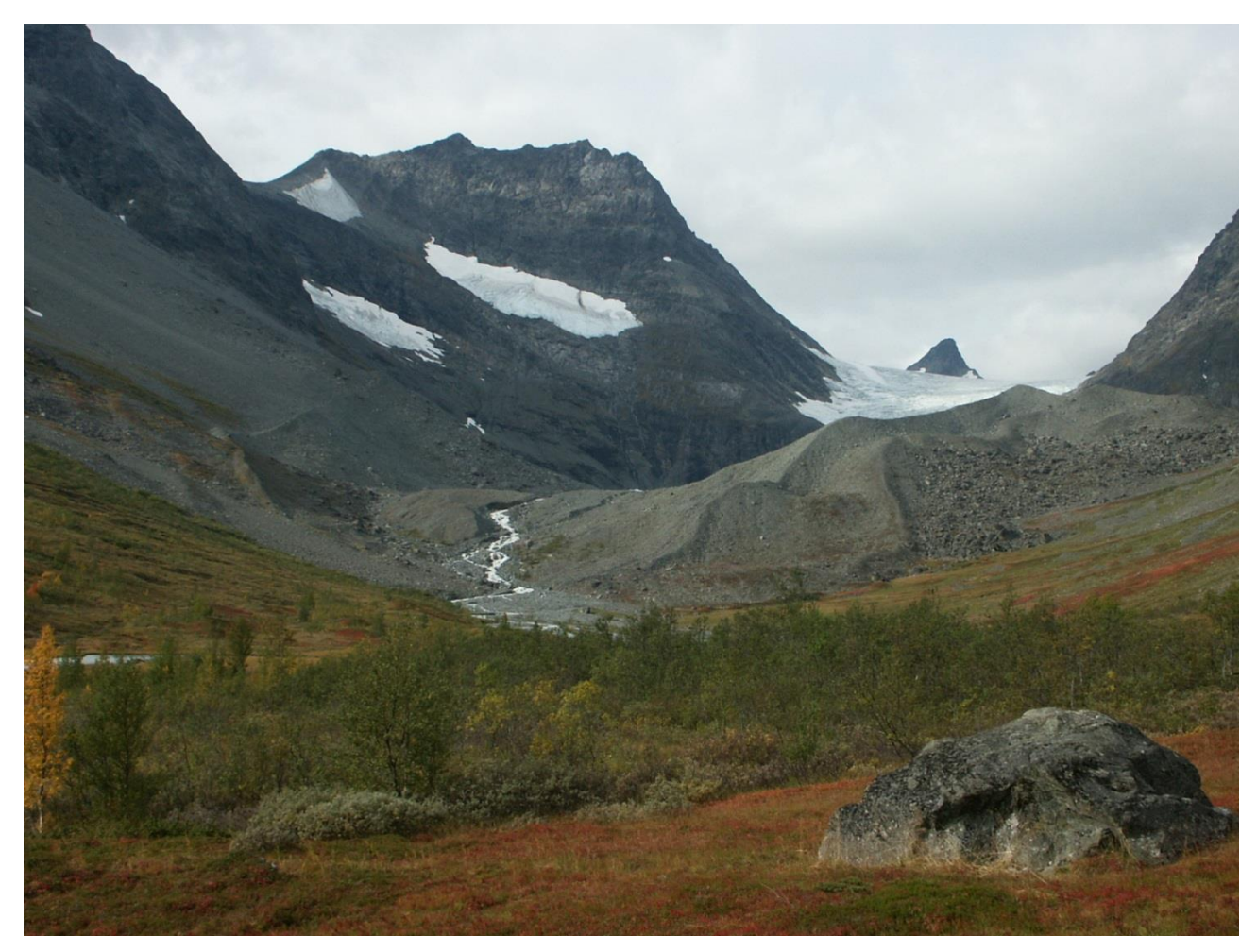
Figure 3 : Steindalsbreen, northern Norway (N 69° 23' 29", E 19° 56' 54"). Topographicallyconstrained valley glacier occupying a classic U-shaped valley. Note the prominent end moraines relating to ice advance during the Little Ice Age in the late 19<sup>th</sup> Century and the erratic boulder in the foreground.

climatic regime. One of the distinct advantages of the landsystems approach is the ability to reconstruct the operation of processes and the characteristics of the parent ice mass far more accurately and in far more detail. In this respect distinctive spatial arrangements of geographies of landforms are invariably far more informative than analysis of any individual landform – the whole is greater than the sum of its parts. One example of this relates glaciers surges, which are rapid advances that are not related to climate. With glacier fluctuations commonly being used to reconstruct past climate change, the ability to distinguish between climate-related and non-climate related advances is of crucial importance. Whilst attempts to identify an individual landform indicative of surges have been largely unsuccessful, ongoing research suggests that they are typically associated with distinctive landform assemblages comprising large push moraines, subglacial lineations and crevasse fill ridges. It is the combination of these landforms that tells the story of how the landscape was created; no one individual landform could tell that story.