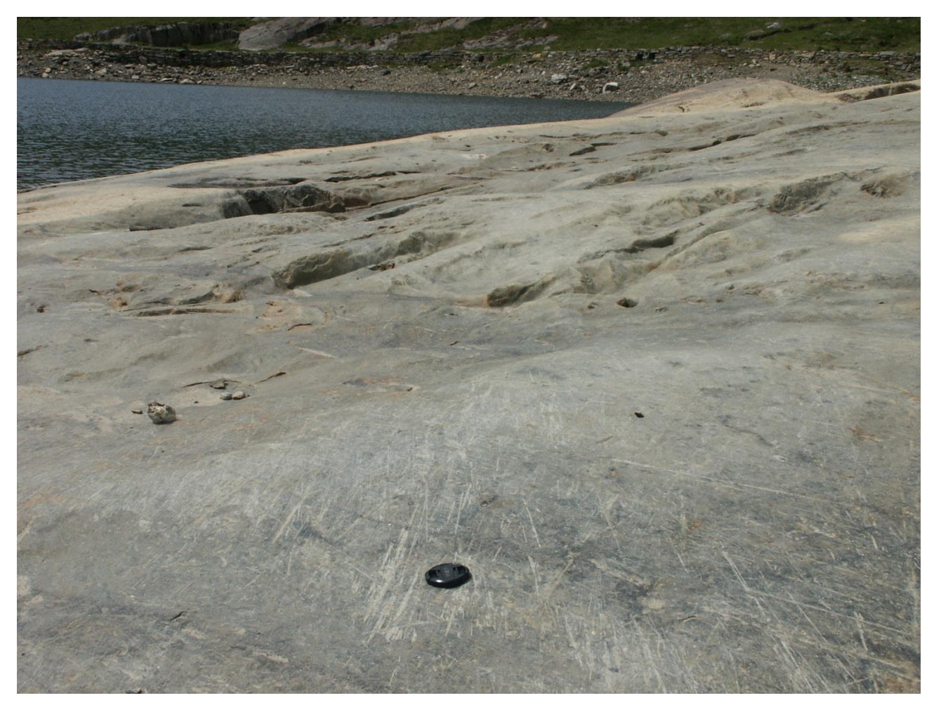
Figure 2 : Striated bedrock surface in Llyn Llydaw, Snowdonia (N 53° 4' 23", W4° 2' 32"). Note the cross-cutting nature of the striations which indicates a change in ice-flow direction. Lens cap for scale.

Recent research in glacial geomorphology has increasingly focused on glacial landsystems . This is an explicitly geomorphological application of the systems approach. A landsystem is an area with a common set of features that are distinct from those of the surrounding area, not only in terms of their topographic characteristics, but also in terms of their constituent materials, soils and overlying vegetation types. This inclusion of earth-surface materials is central to the description and interpretation of depositional features such as moraines, where the internal structure and composition can reveal much about their mode of origin.