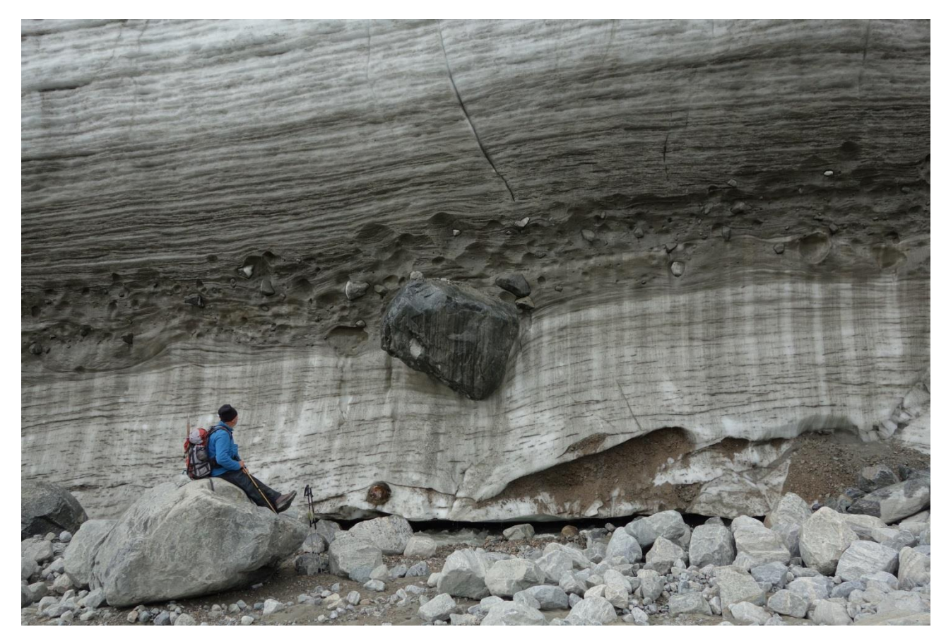
Figure 1 : Active sediment transport within the debris-rich basal ice layer of an outlet glacier on Bylot Island, Canadian Arctic (N 72° 57' 50", W 78° 25' 13"). Note the large erratic boulder entrained within the ice. Figure for scale.

Glaciated landscapes are best understood as part of a system, at the heart of which is the transfer of sediment through the glacier (figure 1). Debris is produced by erosion in some locations, entrained and transported by ice and water, and deposited in other locations. The energy driving this system is the energy that drives the motion of the ice and water through the glacier, and is ultimately connected to the global hydrological cycle and to the physical impact of gravity on surface materials. The system can be observed at a range of timescales: processes can be measured in action at scales from seconds to days at existing glaciers. The effects of processes can be observed in the landscape for many thousands of years where glaciers have existed in the past. The landforms of glacial environments can be regarded as the outputs of this system. Therefore, landforms are best considered not individually in isolation but together as landform assemblages or landscapes; it is the combinations and associations of landforms that tell us most clearly the story of the system that created them and put them together.