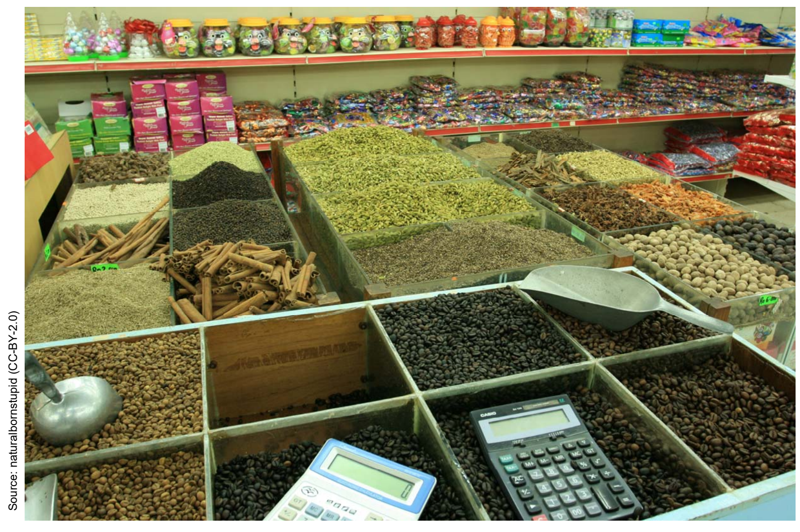
Increased prices for local people

Advancing geography and geographical learning