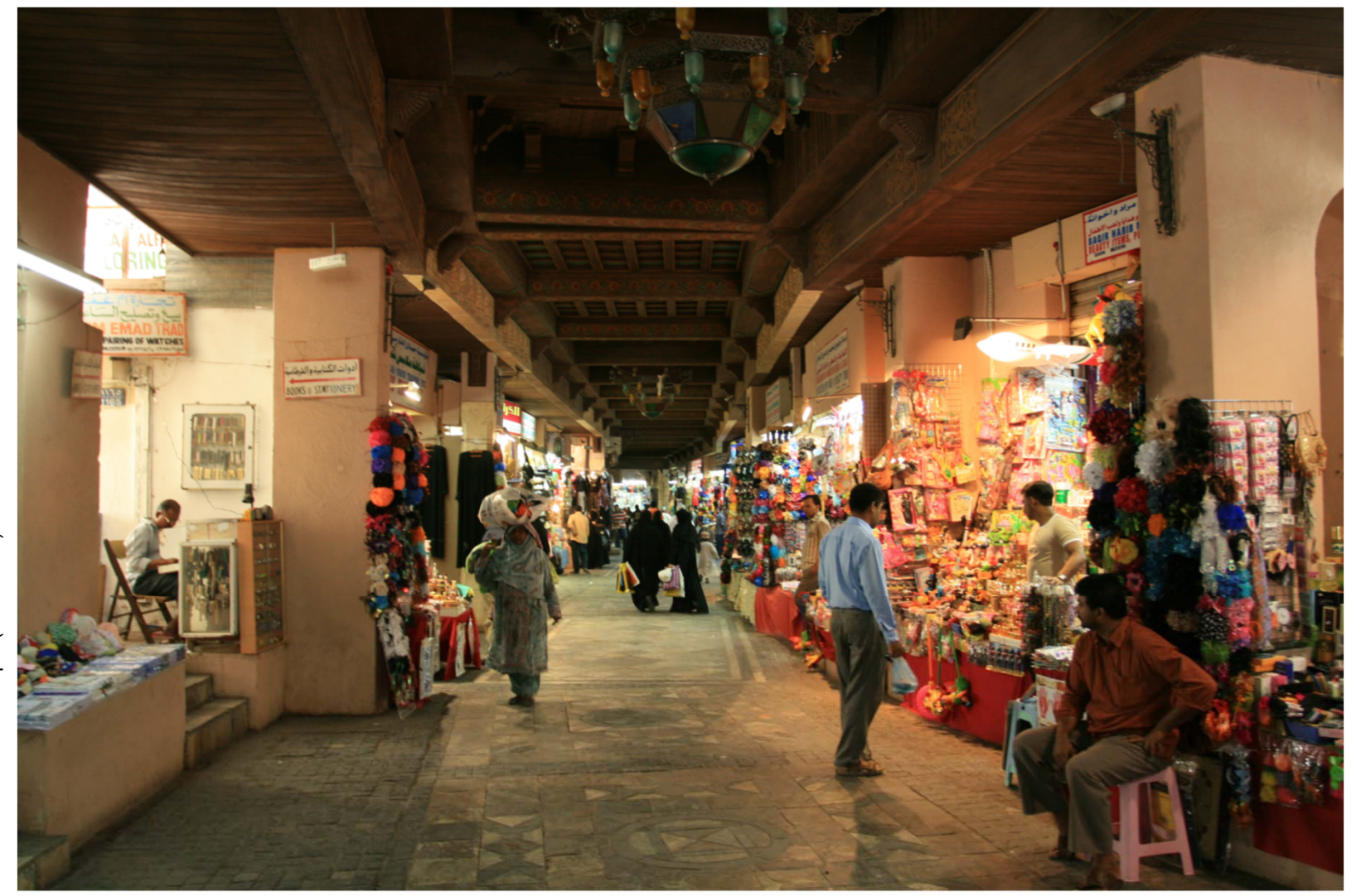
Increased demand for locally produced goods

Advancing geography and geographical learning