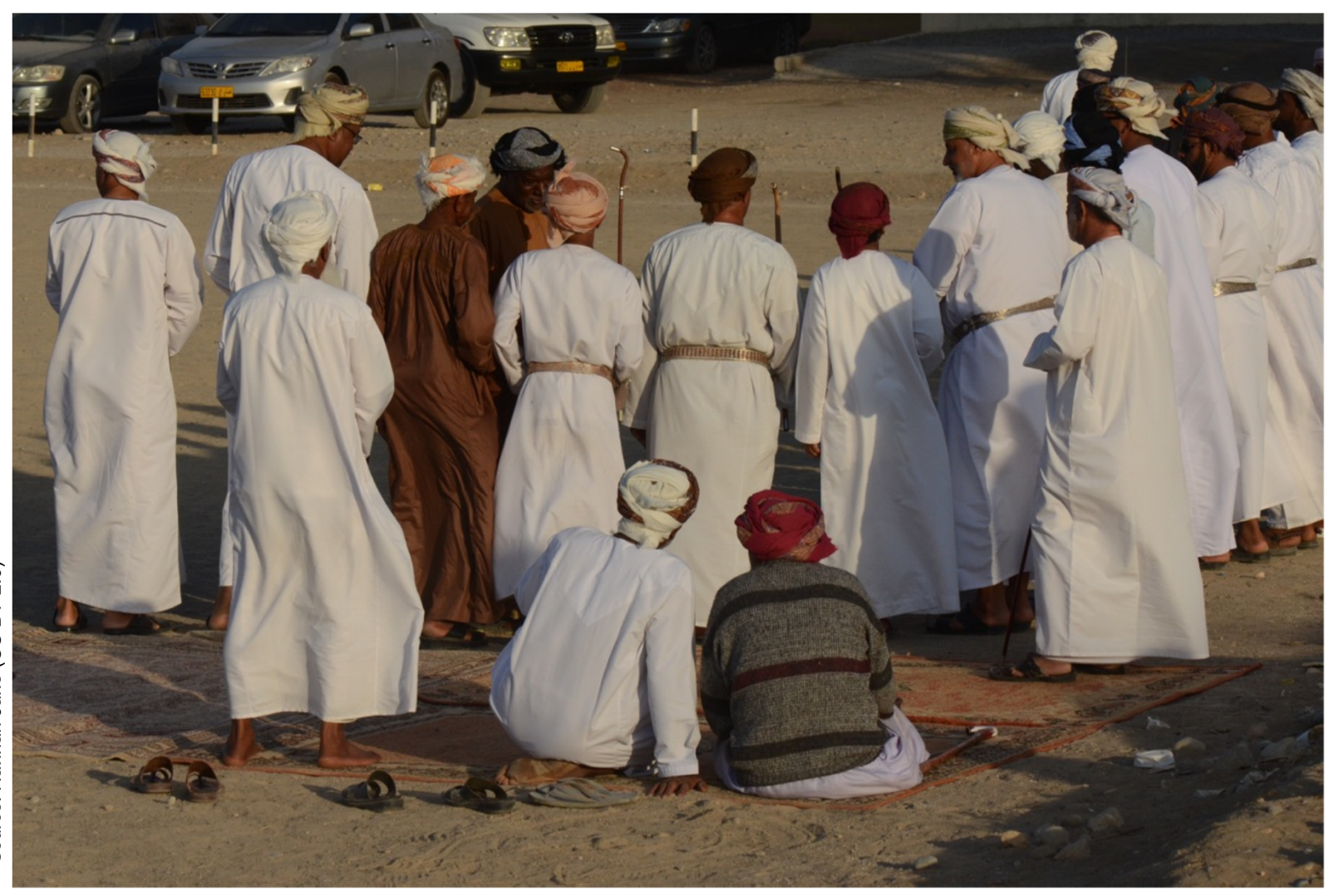
Seasonal employment for local people

Advancing geography and geographical learning