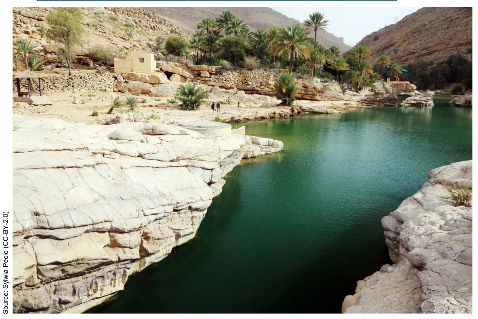
Increased use of scarce resources such as water

Advancing geography and geographical learning