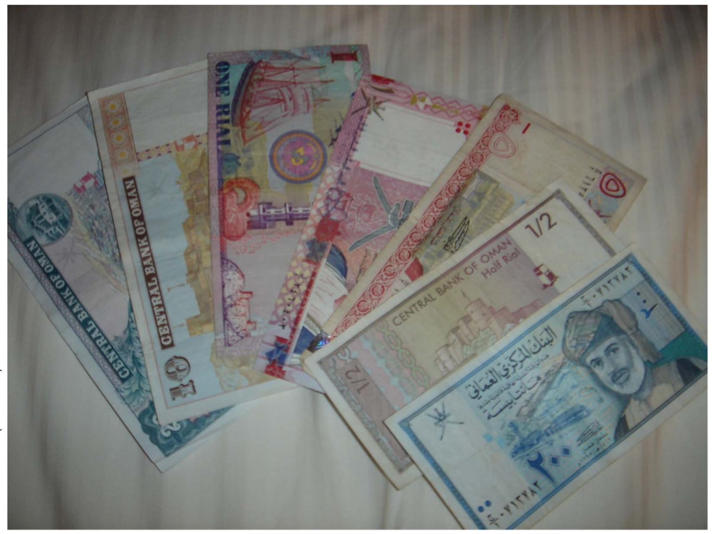
Extra income into the region

Advancing geography and geographical learning