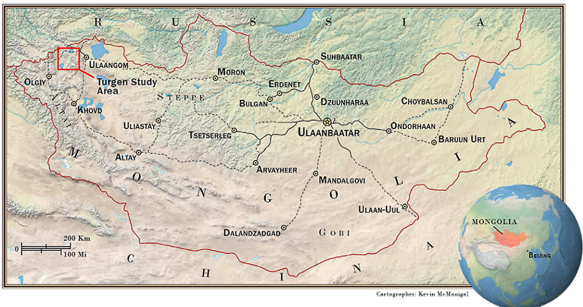
Figure 1 Location of the study area in the Turgen Mountains in western Mongolia

The research was conducted in the Turgen Mountains in northwestern Mongolia (Figure 1). The mountains