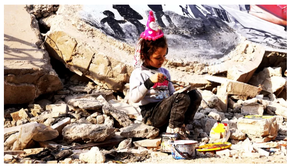
Why did the UN's quake aid take so long to arrive?