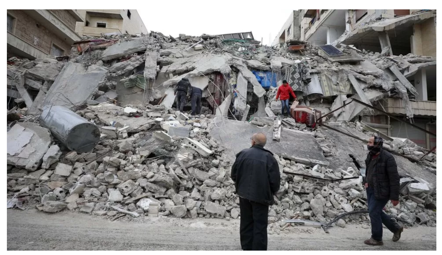
| More than 10,500 buildings in north-west Syria were damaged by the quake

More than 7,000 people died in February's devastating quake and for those who survived the situation is now even tougher.