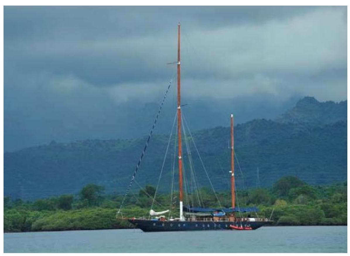
The Mir - the research base