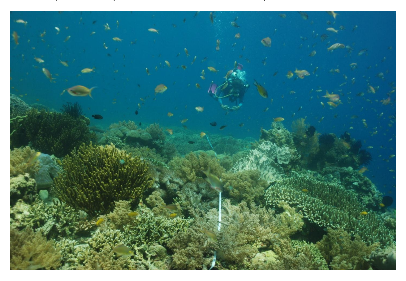
Species abundance observations being taken along one of the 50m long transects.