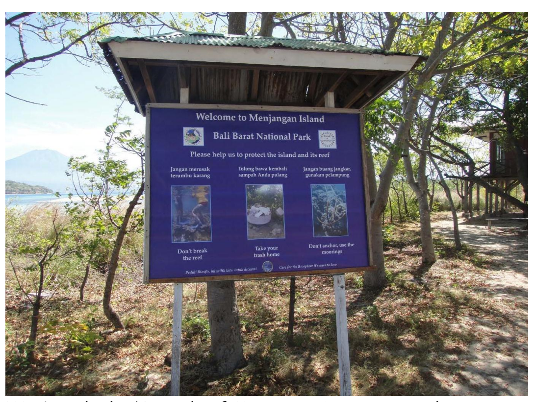
Work with the 'Friends of Menjangan' to protect the area.