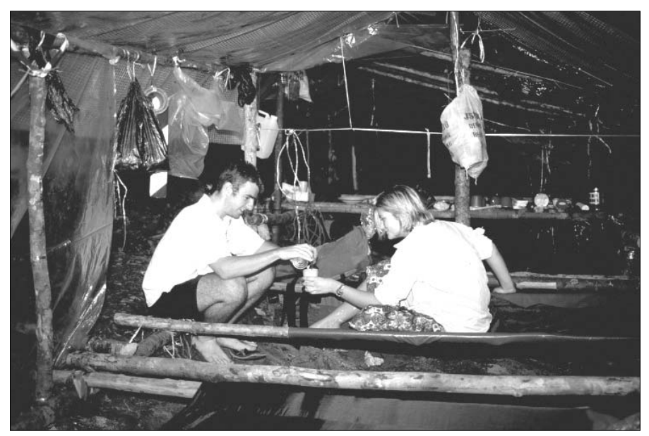
Figure 24.2 Sleeping off the ground (C. Caldicott)

litter can hide all sorts of fauna and, although snakes will depart if they detect your approach, to surprise a resting snake by stepping on it from your hammock may provoke a defensive bite. Whatever form of shelter is chosen, a sleeping mat enhances comfort and a silk sleeping bag liner used alone may give sufficient warmth. Group areas such as communal dining can be protected by large tarpaulins.