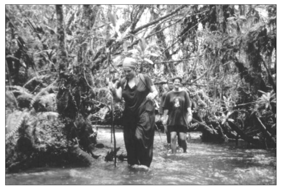
Figure 24.1 Wading through a jungle river – Irian Jaya

The command structure is best decided at the outset with roles and areas of responsibility such as food, medical kits, science data and so on defined and, importantly, agreed by all members to avoid potential conflict in the field. Team bonding and a sense of ownership are helped enormously by shared preparation and realistic "trial runs" before the expedition departs.