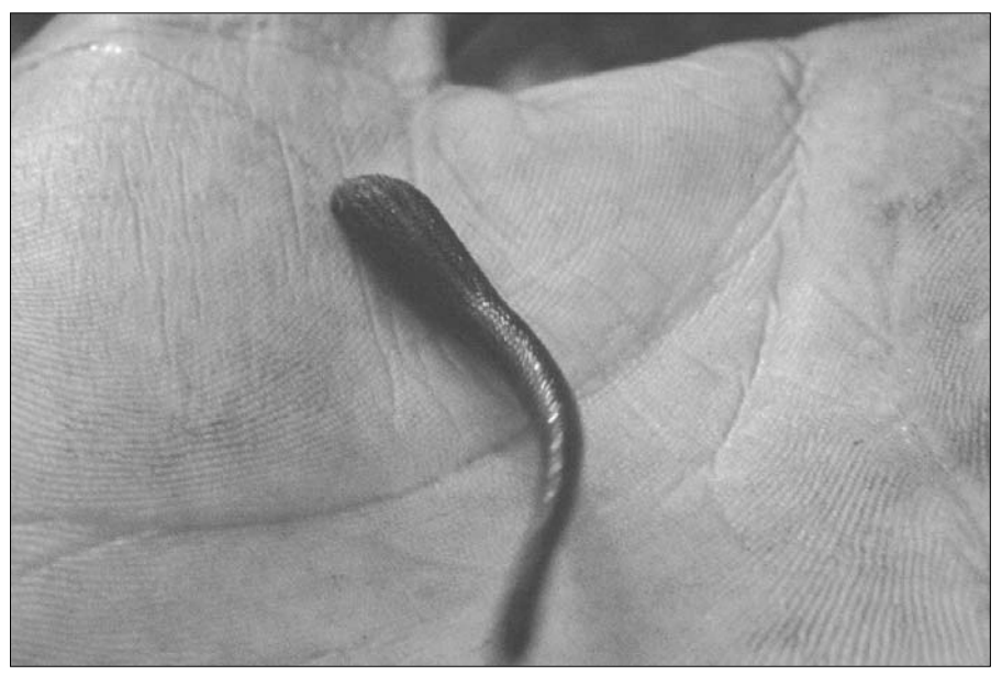
Fig. 24.4 Leech on hand

and boots provide little protection but DEET offers some deterrence. A tickling sensation or sharpness as they bite may give them away but often the first indication is blood-stained clothing. As they inject an anticoagulant, bleeding persists but a single bite is more messy than serious. Before attachment, they can be flicked off but pulling them off after they have taken hold may leave mouth parts behind and predispose to infection. Of themselves, they are not thought to transmit infections. Application of iodine tincture, salt kept dry in a film canister, other chemical irritants or a lighted cigarette all persuade leeches to let go. Burning them off with a lighter is hazardous to both parties! Apply pressure if necessary to stop the bleeding and treat leech bites as wounds.