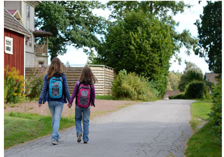
• Post 16 educational choices in Leicestershire

New approach to modelling, new data bases and research needed