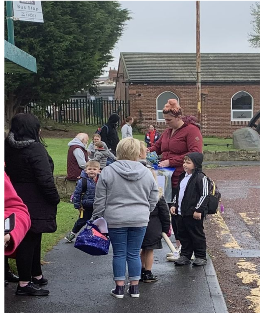
Stuck in Chopwell