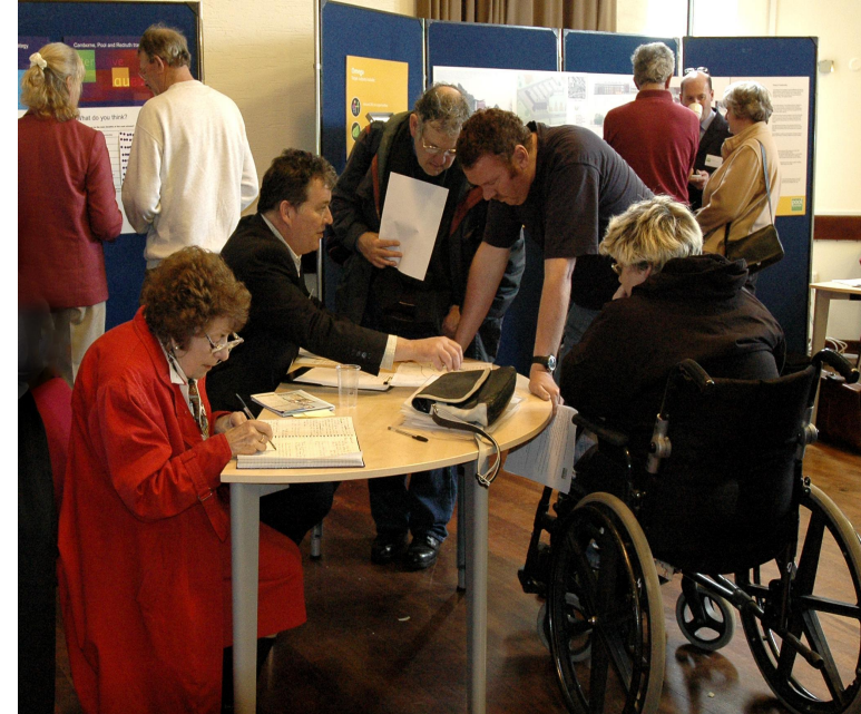
Community planning at mobility centre