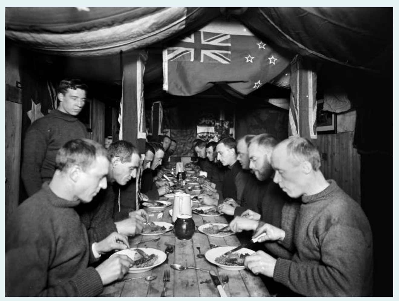
(27) Mid-winter Dinner