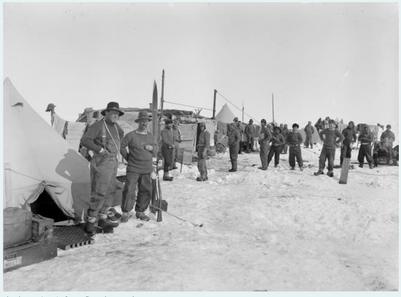
(38) On the drifting floe, 'Ocean' Camp