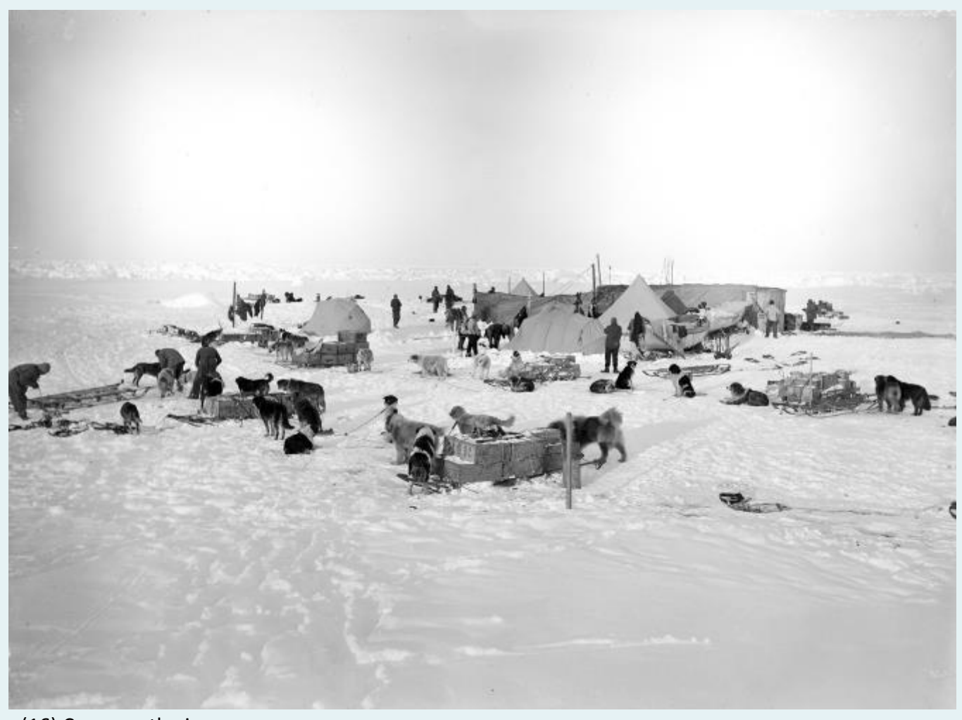
(16) Camp on the ice