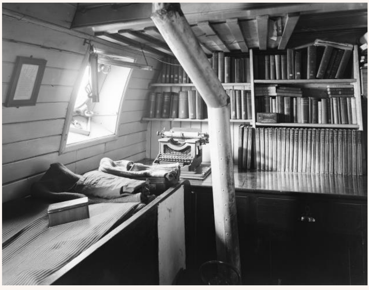
(41) Ernest Shackleton's cabin on the Endurance