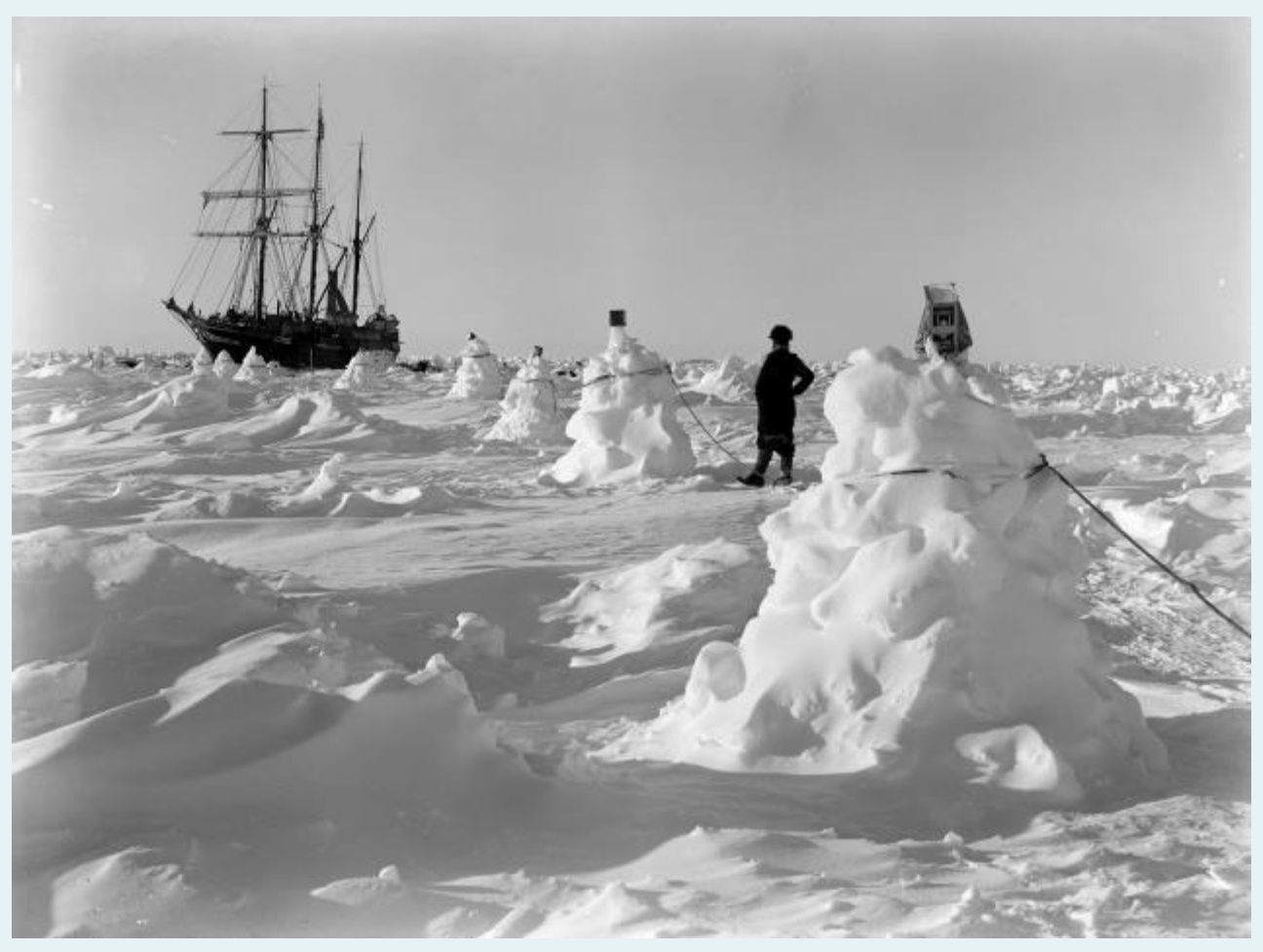
(25) Ice mounds and rope serve as guidance to crew in darkness and blizzards