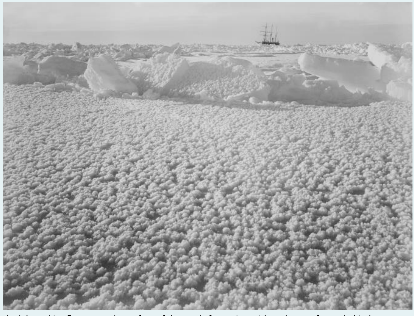
(17) Crystal ice flowers on the surface of the newly frozen ice, with Endurance frozen behind