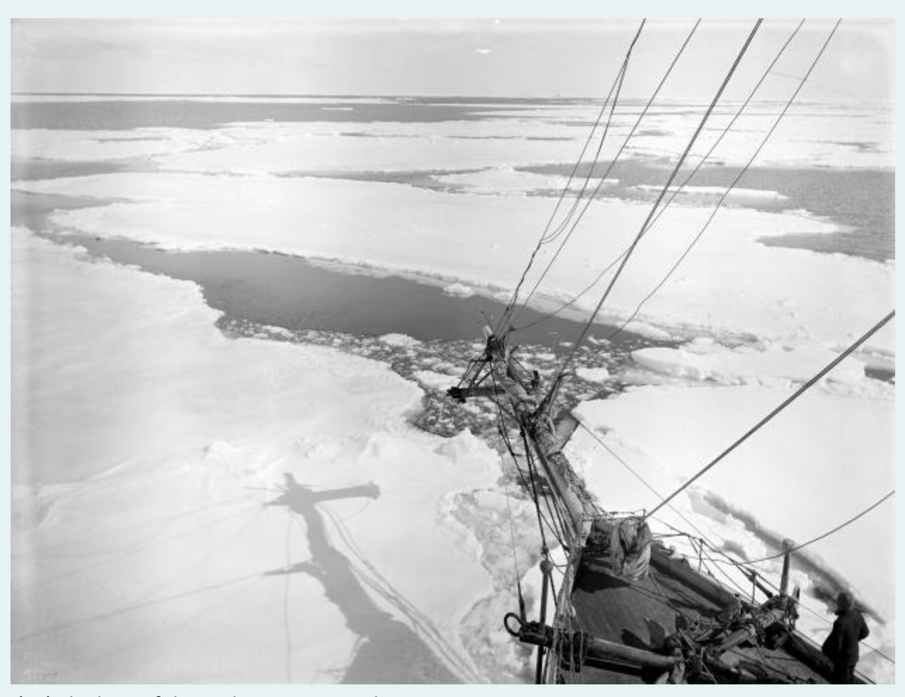
(36) The bow of the Endurance enters the ice