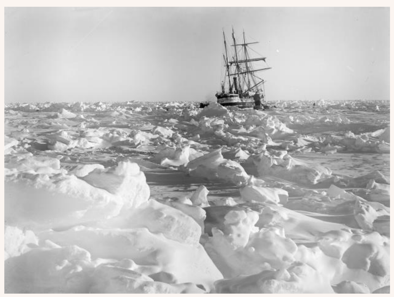
(40) Endurance in the ice