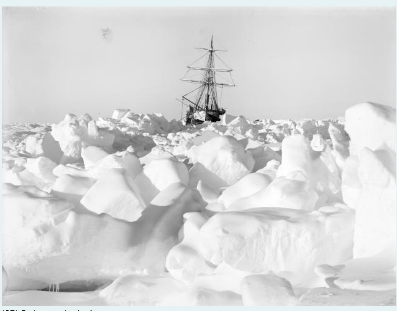
(37) Endurance in the ice