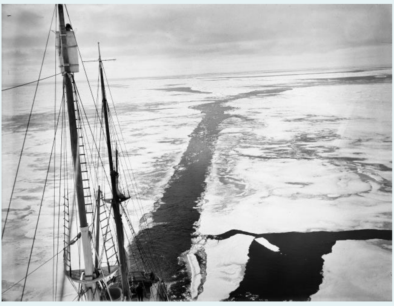
(14) Mast of the Endurance with the wake of the ship through a field of young ice