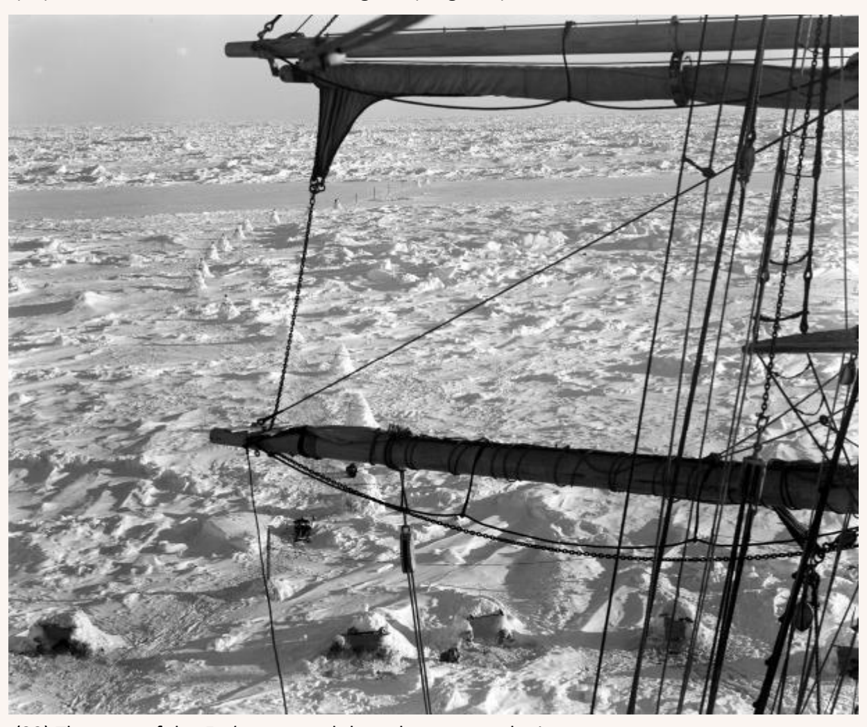
(32) The mast of the Endurance and the pylon way on the ice