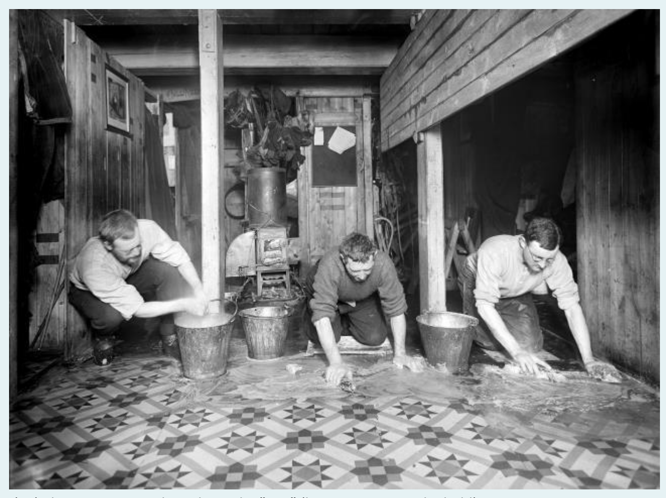
(15) The Scientists washing down the "Ritz" (living quarters in the hold)