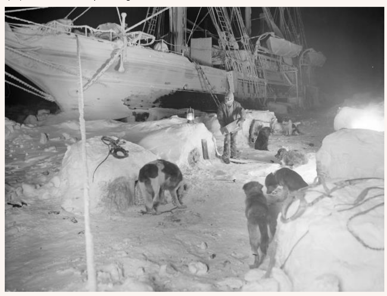
(34) Kennels and dogs on the ice at night