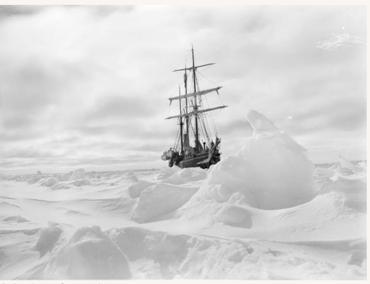
(29) Endurance frozen in the ice