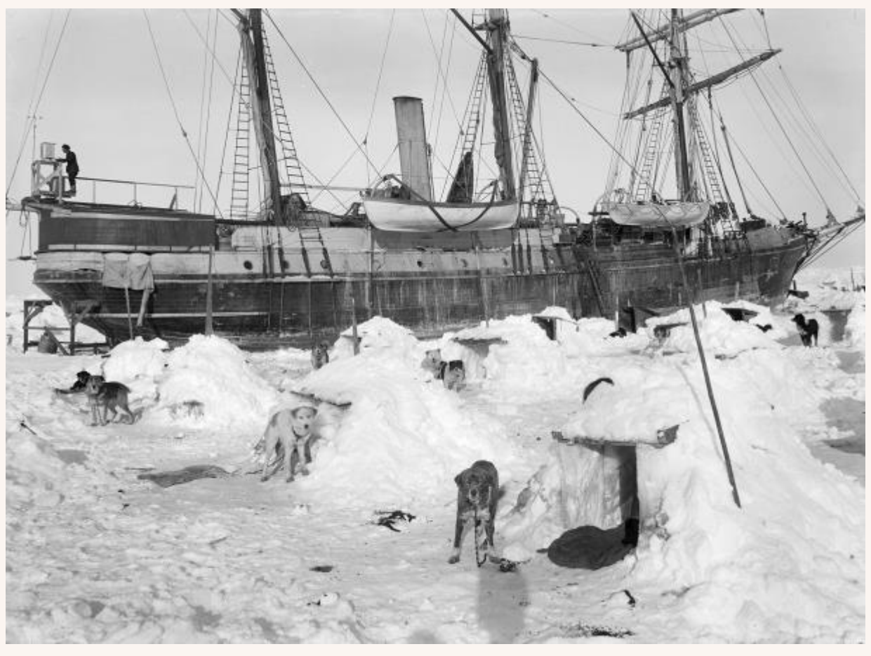
(31) Kennels on the ice in the form of igloos ('dogloos')